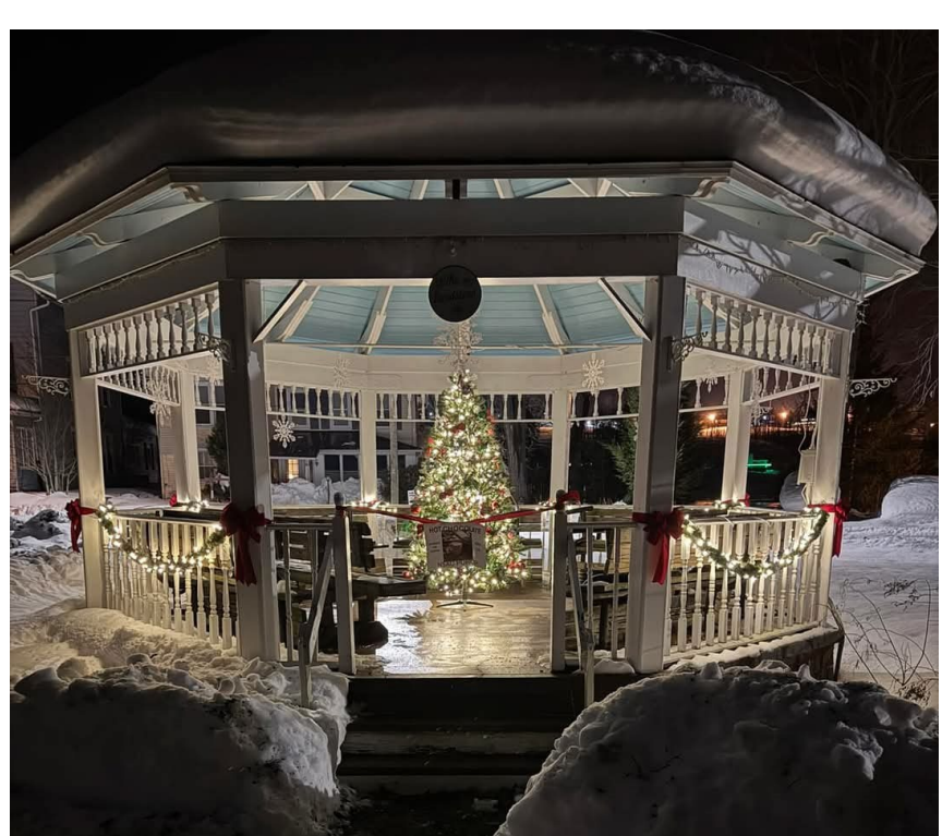
Gazebo in Lily Dale decorated by NSAC

Hot chocolate, fellowship and unity were celebrated by all.