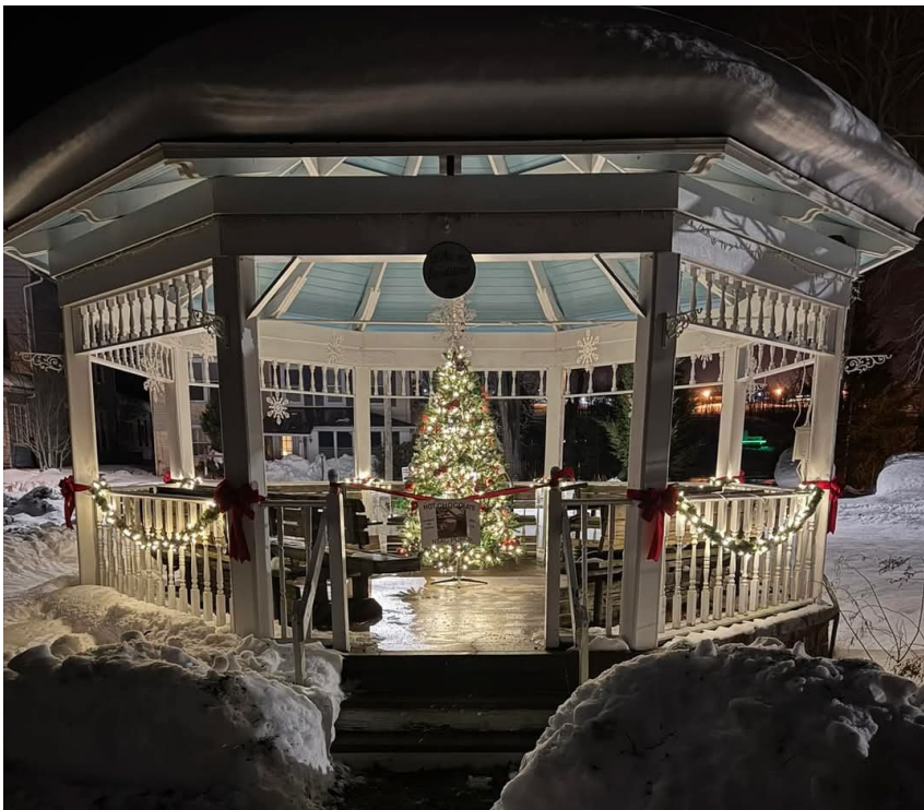
Gazebo in Lily Dale decorated by NSAC