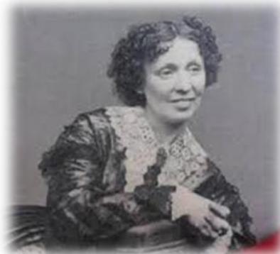
Emma Hardinge Britten

May 27, 1953: Event - NSA of USA changed to National Spiritualist Association of Churches.