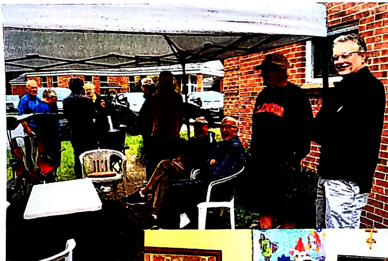
Our Volunteer dudes at the annual BBQ