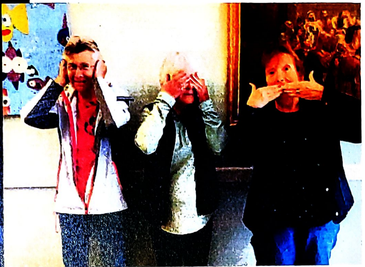
Our entertaining volunteers at the annual BBQ