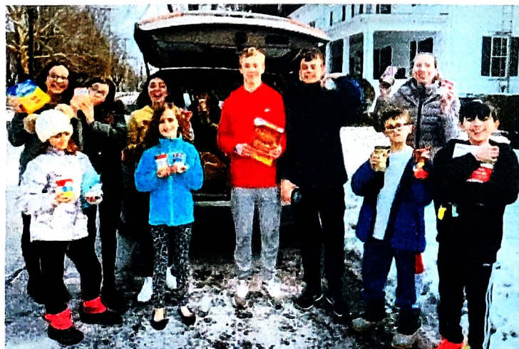
First Presbyterian Church Youth Group food collection