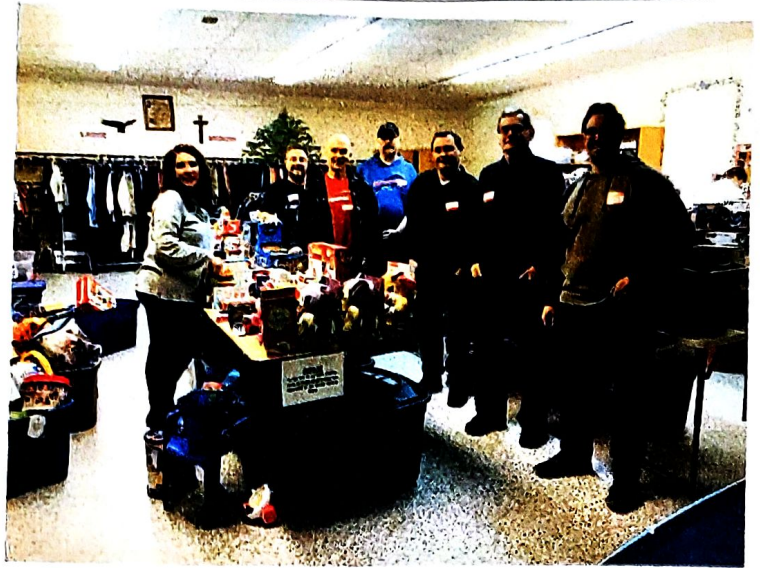
Capital One employees helping to sort toys