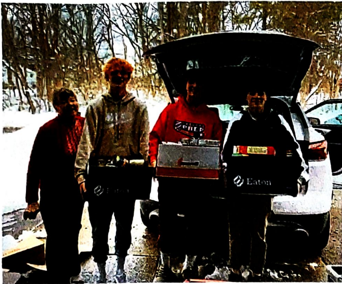
East Aurora High School food collection