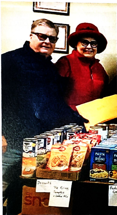
Immaculate Conception gift card donation