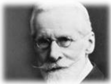
Sir William Crookes