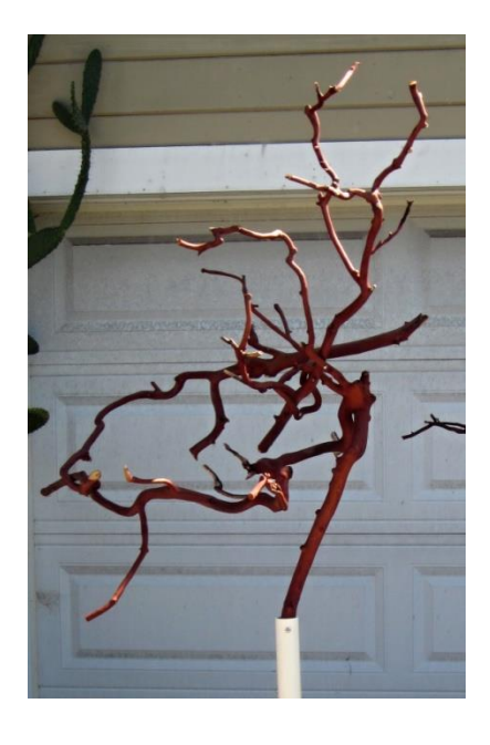
The AviArtisan is a perfect choice for creating an indoor tree...

The AviBase also supports the completely customizable line of AviStation products, again, sized at your choice – for small, medium or large birds.