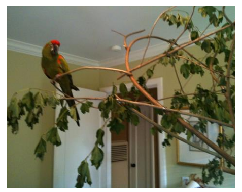
or a more naturally attractive T-Stand.