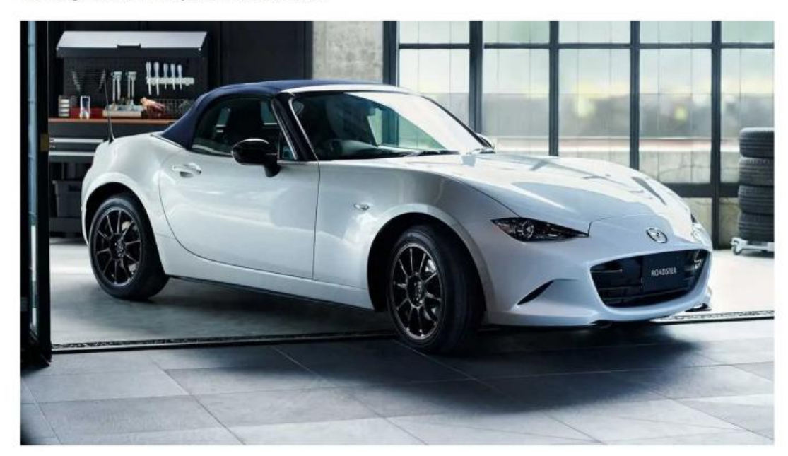
By: Adrian Padeanu

The next generation is unlikely to come out before 2024.