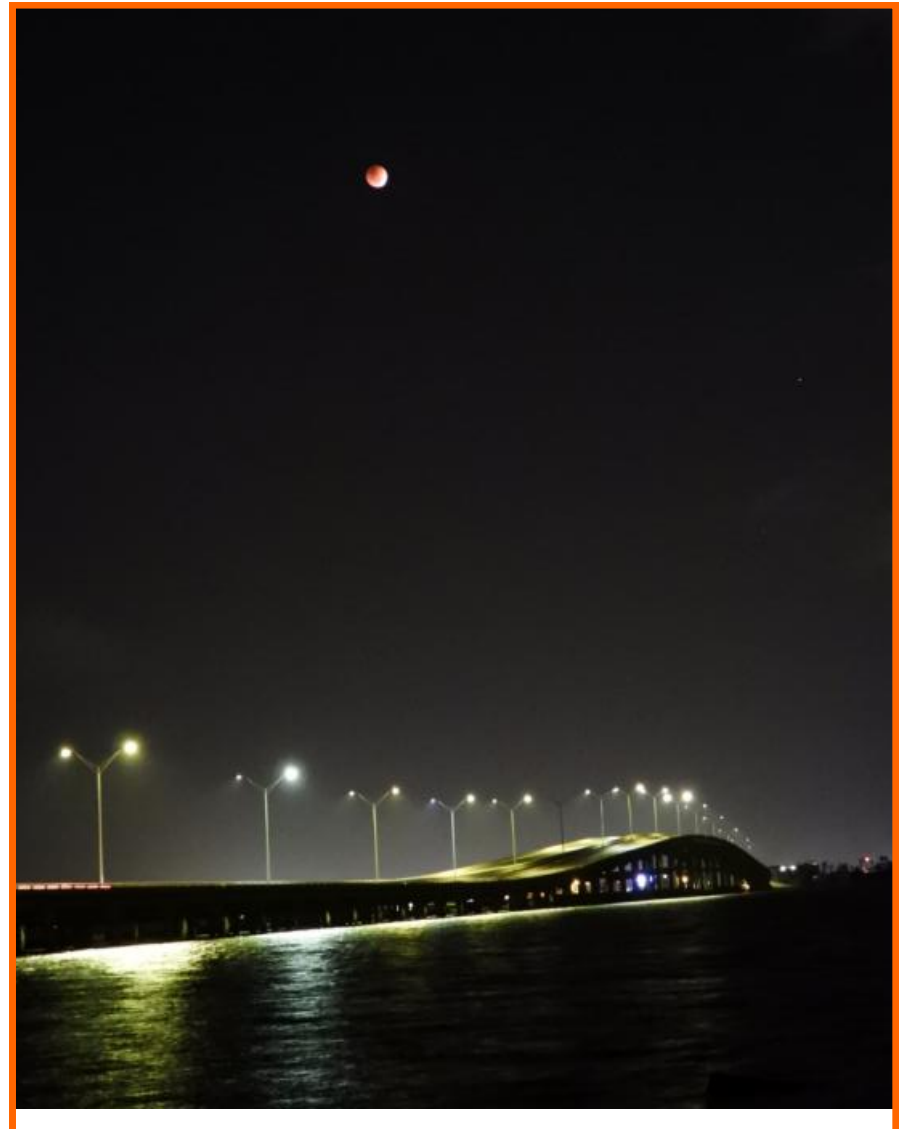
This is the Cape Coral Bridge early in the lunar eclipse process as shot from the Ft Myers side of the bridge.

The full lunar eclipse at it's peak. This was a 500mm lens, shot at f5.6, 1 second exposure, ISO at 1600