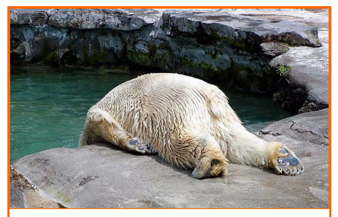
Was this like your day after THANKSGIVING? Me too!