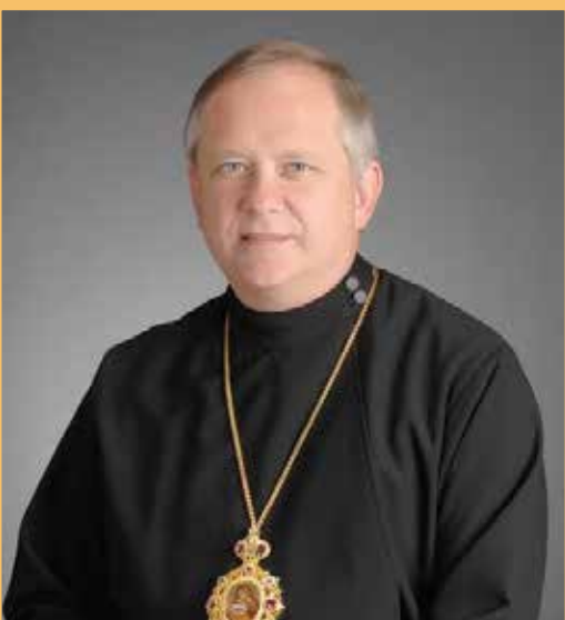
Archbishop William Skurla Archeparchy of Pittsburgh