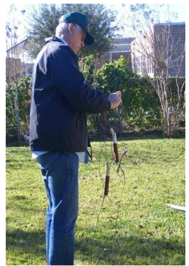
4) Doing the "detangle"