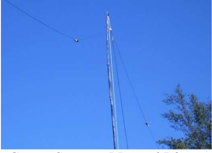
Center Support Mast – 25 feet