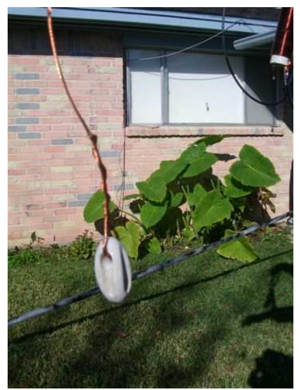
2) End Insulator