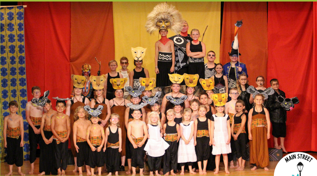
Each summer, the Mainstreet Arts Council brings the magic of live theater to Quinter with their Summer Theater Festival, giving local youth and community members the chance to shine on stage. Pictured: the talented cast of The Lion King performing in Quinter.