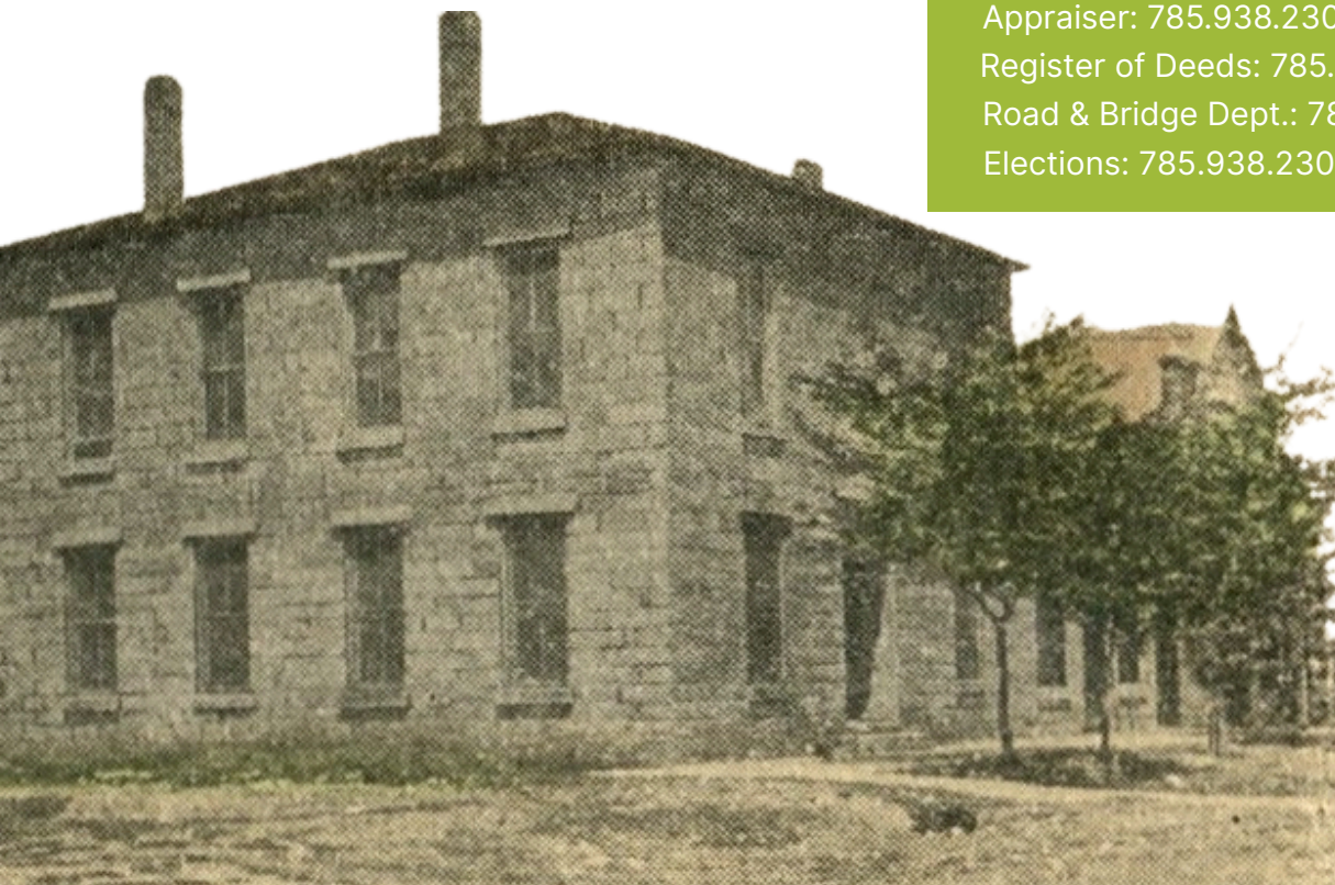
Original Gove County Court House

County Clerk: 785.938.2300 Treasurer: 785.938.2275 Appraiser: 785.938.2301 Register of Deeds: 785.938.4465 Road & Bridge Dept.: 785.938.4450 Elections: 785.938.2300