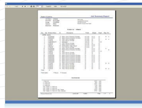
Job reporting reflecting manufactured and purchased parts.