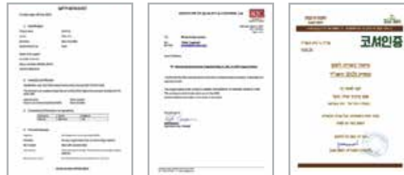
IQC Organic Quality Certificate