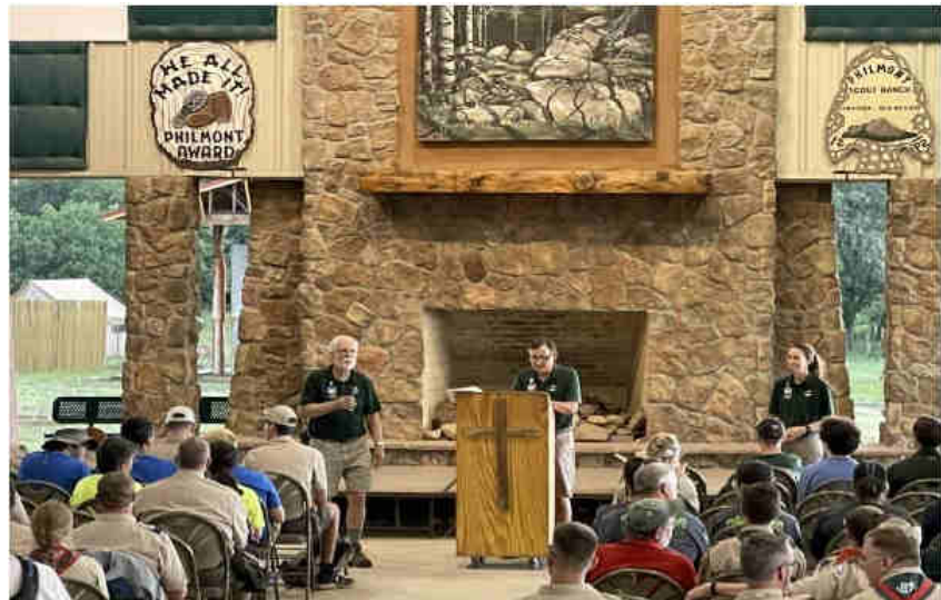
Chapel held in the Baldy Pavilion at the Silver Sage Center during inclement weather.