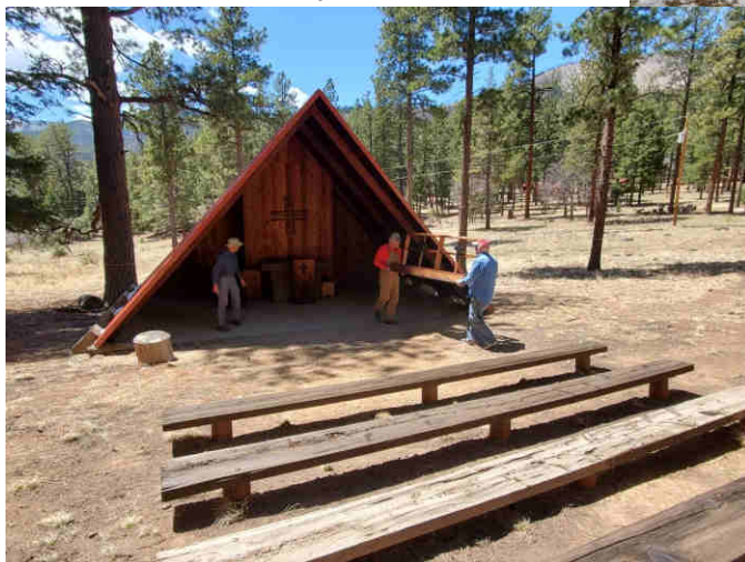
Cimarroncito Chapel ▼