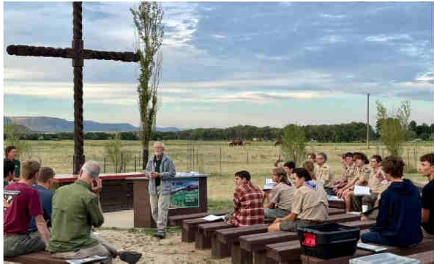
Philmont's beautiful outdoor Protestant chapel and awesome backdrop