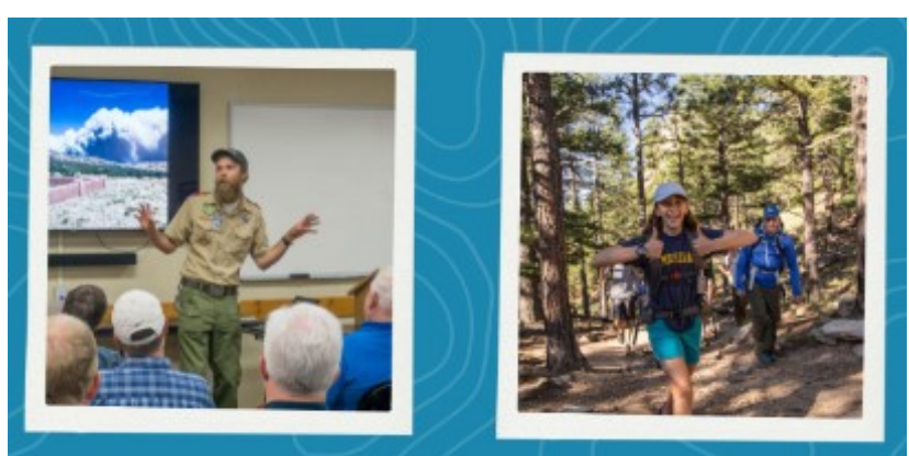
Experience the magic of Philmont - So much to learn, do and see.

More info and register now at: www.philmontscoutranch.org/ptc