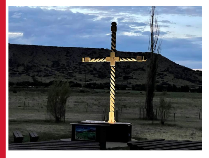
Base Camp Protestant Chapel, nighttime