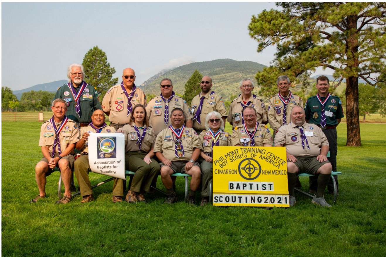
The faculty and attendees of Baptists in Scouting , Philmont Training Center, during the week of July 11, 2021.

Following the COVID-19 restrictions of 2020, Baptist Scouters were more than ready to get back into more traditional forms of action. Four highlights from early 2021 include the Cimarroncito Protestant Chapel refurbishment in May, the Baptists in Scouting course at Philmont Training Center in July, the election of a new slate of ABS officers in July, and the relaunch