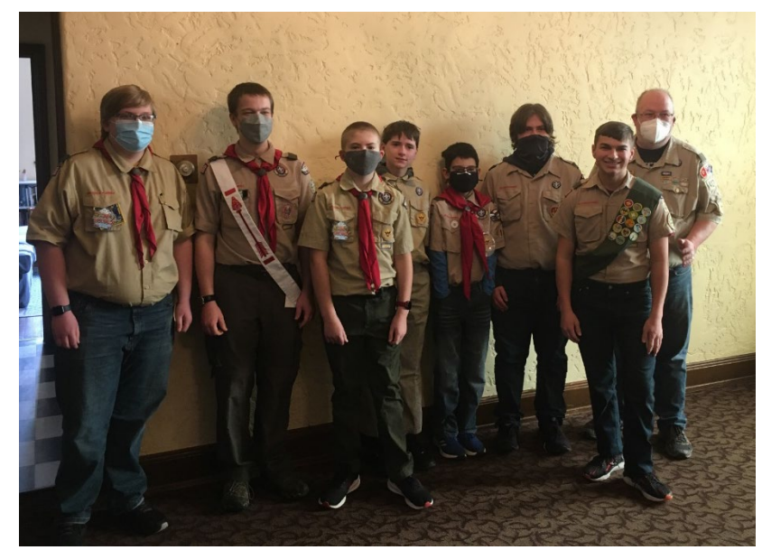
Members of Troop 417 chartered to The Connecting Church Milton Seventh Day Baptist of Milton Wisconsin attend worship services for Scout Sabbath on Feb 5.