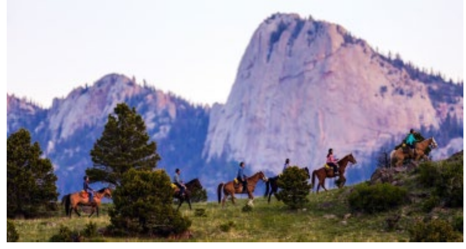
A Philmont Training Center conference offers iconic activities for all family members

We would like to have many Baptists Scout leaders at this course. If you want more information or you would like to register for this course, please go to <u>Philmont Training Center</u> <u>Conferences - Philmont Scout</u> <u>Ranch</u> to get more information.