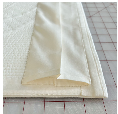
Figure 14: Side view of the finished quilt sleeve. It can be tempting to only stitch the top and bottom, leaving the sides of the sleeve open. Resist this temptation, and sew around the entire sleeve!