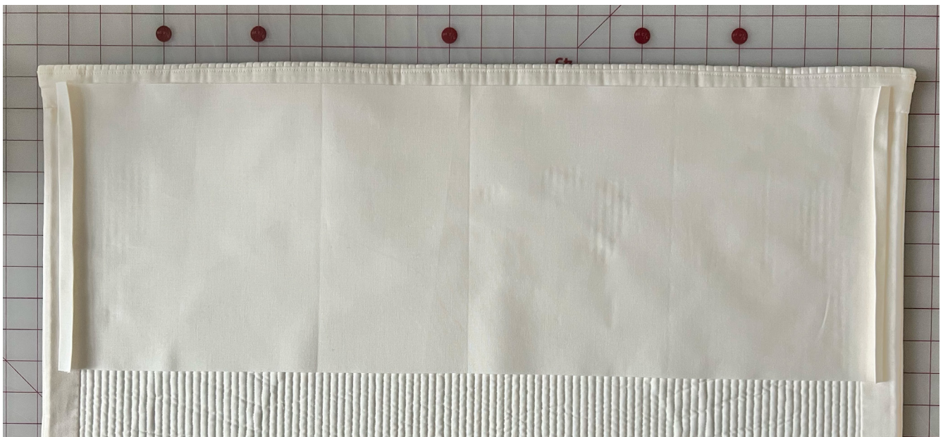
Figure 2: Hanging sleeve placement, ends double folded, on the back top edge of the quilt, checking the size and placement of the sleeve.

Quilt Hanging Sleeve- A quilting technique tutorial by Audrey Esarey • #QuiltSleeve