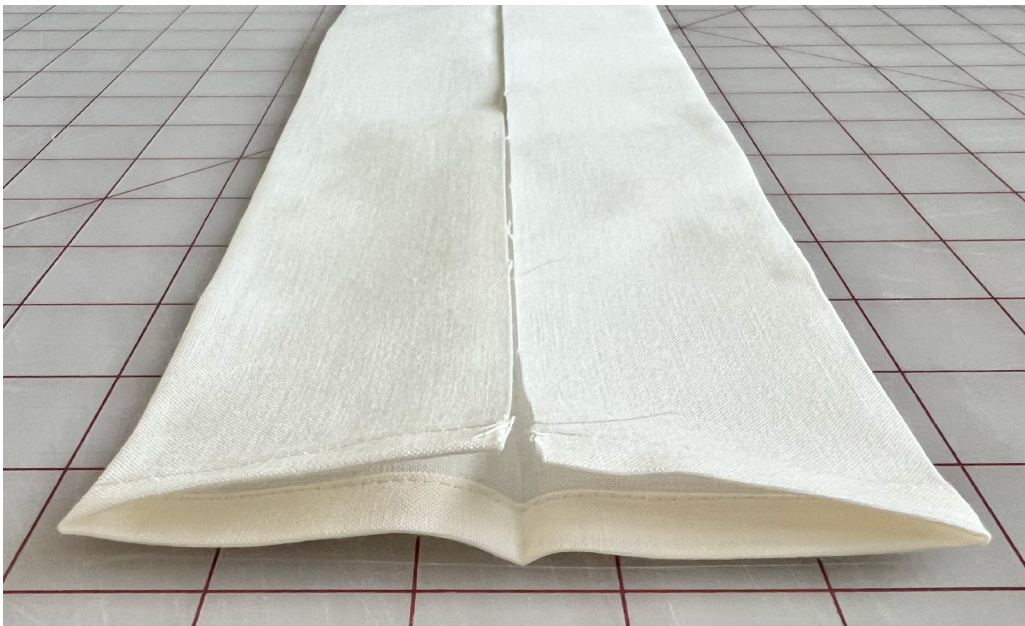
Figure 6: View from the end of the sleeve, pressed.