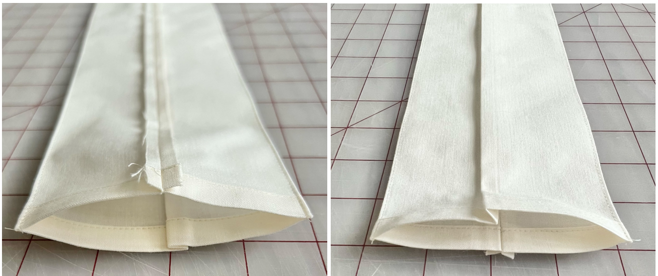
Figures 8-9: View from the end of the sleeve. The opening of the sleeve is visible. There is edge stitching on each side of the sleeve, locking in these folds.