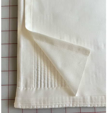
Figure 5: Edge of the rectangle stitched, right side of the fabric is visible on the corner flap that is folded.