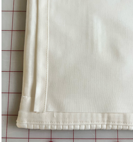
Figure 4: Edge of the rectangle stitched, wrong side up