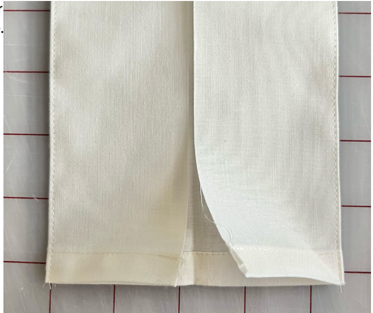
Figure 7: View from the end of the sleeve. There is edge stitching on the creases of the sleeve, locking in this fold.

7. Align the two raw edges with wrong sides together. Stitch the final center seam, press open. (Figure 8) After doing this, the back of the sleeve with the seam will measure 4". The top of the seam will have more fabric, creating a D shape. This provides space inside the sleeve for a hanging rod. Without this extra fabric, the rod would push against the front of the quilt, making a visible hump at the top of the quilt. When pressing this flat, it creates a fold in the top of the sleeve. (Figure 9) There's no real advantage to the fold on the top of the sleeve from a hanging perspective. This fold helps me with the alignment on the back of the quilt during pinning and hand stitching the sleeve.