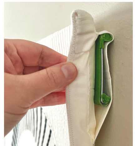
Figure 15: Example of Hanging a quilt with wide pocket curtain rod.

Quilt Hanging Sleeve- A quilting technique tutorial by Audrey Esarey • #QuiltSleeve