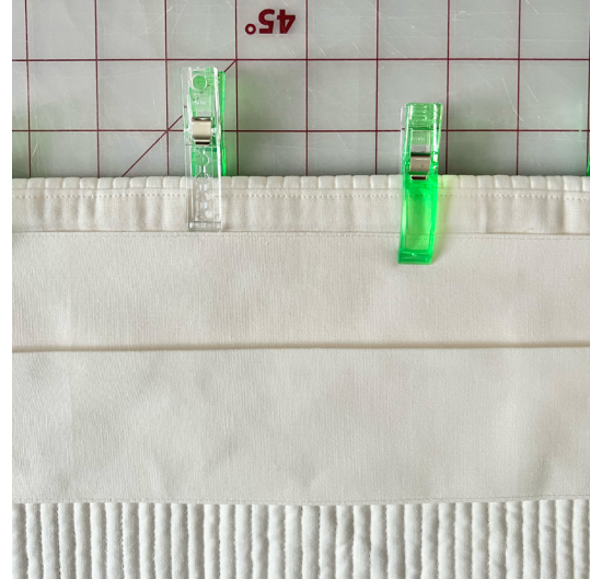
Figure 11: Both the clear and green side of the Wonder Clip is visible. The green side is moved down to secure the sleeve.