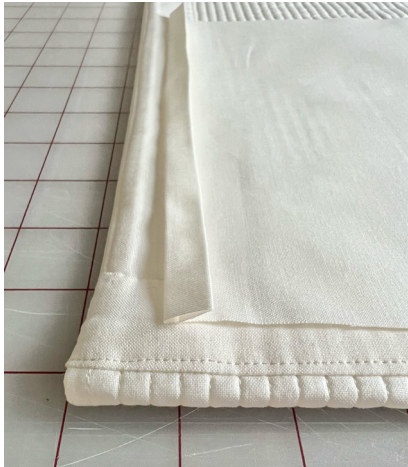
Figure 3: Edge of the rectangle double folded and pressed.