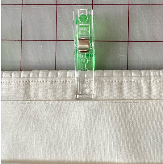
Figure 10: Clear side of the Wonder Clip is visible with 1/4 inch measuring increments.