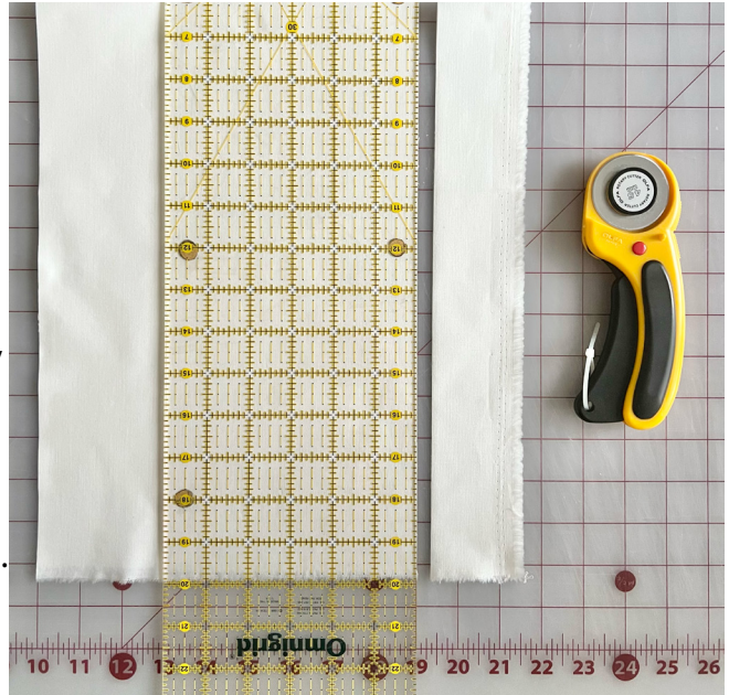
Figure 1: Trimming 9 inch wide hanging sleeve fabric.