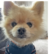
Page 3 Pet Spotlight