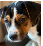
Page 3 Pet Spotlight

Published by the Jefferson Park Neighborhood Association