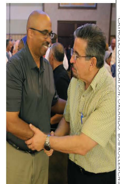
CATHOLIC CONVOCATION, ORLANDO.