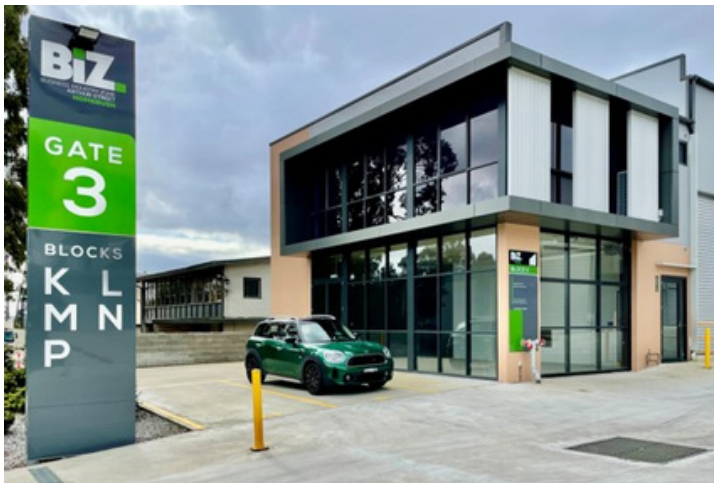
← Pictured: façade of Homebush West Hub