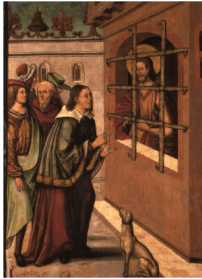
John the Baptist visited in prison - Master of Astorga 16th century