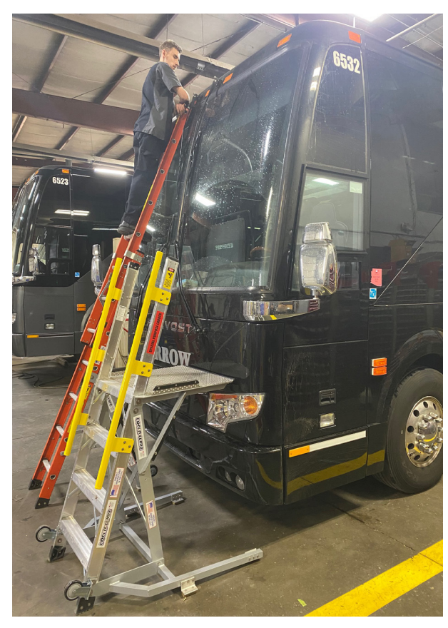
LOCKNCLIMB'S three ergonomic safety ladder system has been designed to afford safer comfortable working access to all maintenance points around motor coaches, buses, sport vans and other work and leisure vehicles.