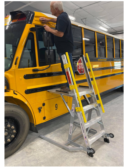
44LNCTRKENG affords safe stable working access to all service points along the side and rear, including running lights, windshields, racks, etc.