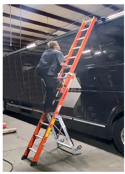
LNCEXTTRKFIBER is a 52-lb. fiberglass ladder that extends from 8' to 13' used to rech high areas around and on top of the vehicle with top rest support.