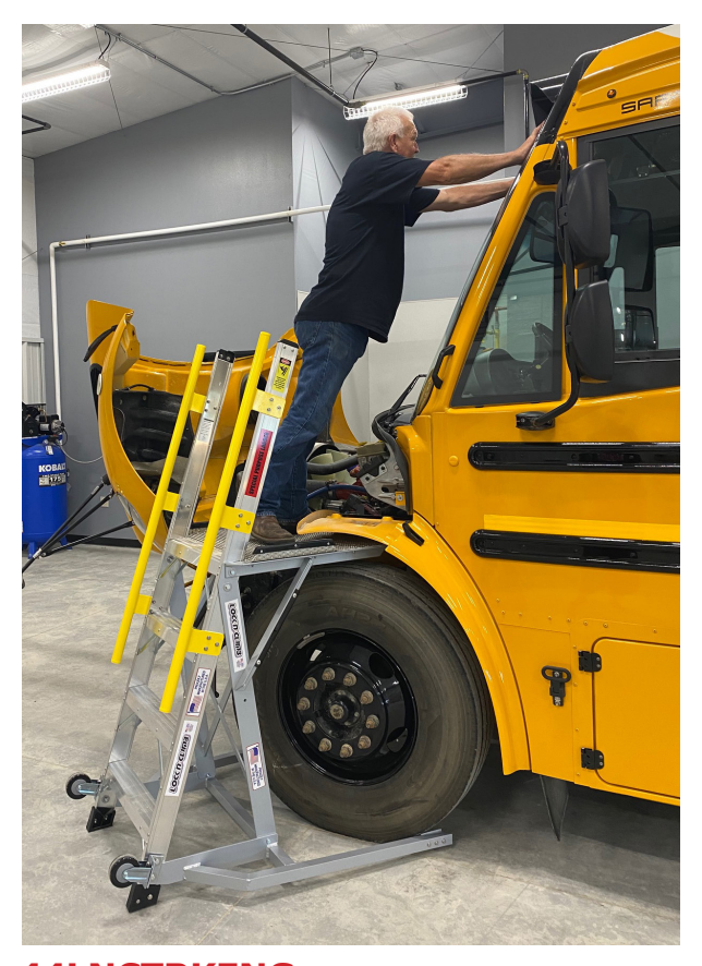
44LNCTRKENG The wide base slides around the tire to allow stable working access from the slip-resistant platform to the engine, windscreen, wipers, running lights and other ard to reach areas front and rear of the cab.