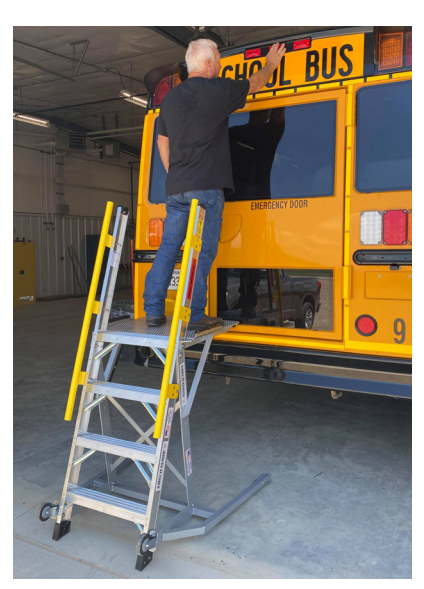
44LNCTRKENG affords safe stable working access to all service points along the side of the bus and at the rear.