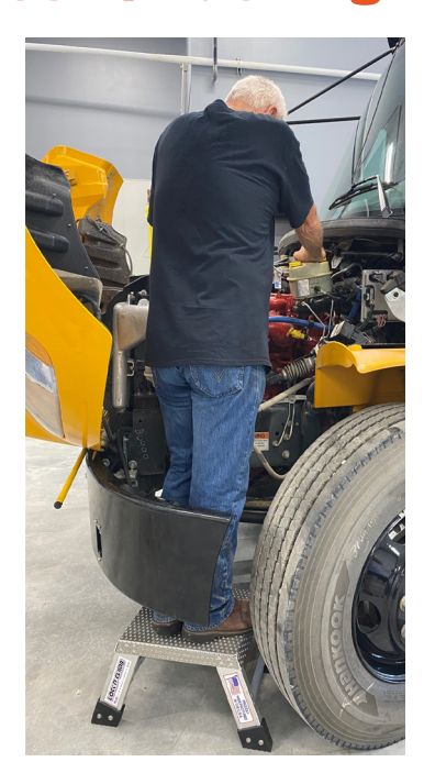
15LNCMINISTAND fits neatly behind the tire and bumper. Sturdy slip-resistant platform helps prevent foot thrombosis.