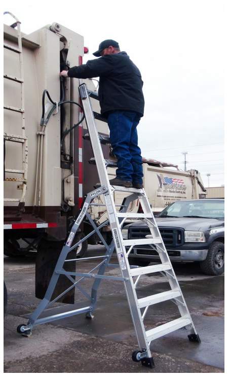
10LNCPYLON: Lightweight free standing ladders rolls easily and sets up quickly to reach service points on extra wide treads.