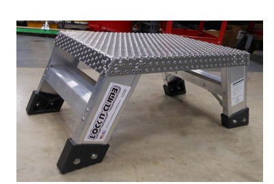
The 15LNCMINSTAND and 20LNC-MINSTAND fit between the tire and bumper and provide stable slip-resistant platforms to work on the truck engine.

WATCH A VIDEO: https://vimeo.com/504214206