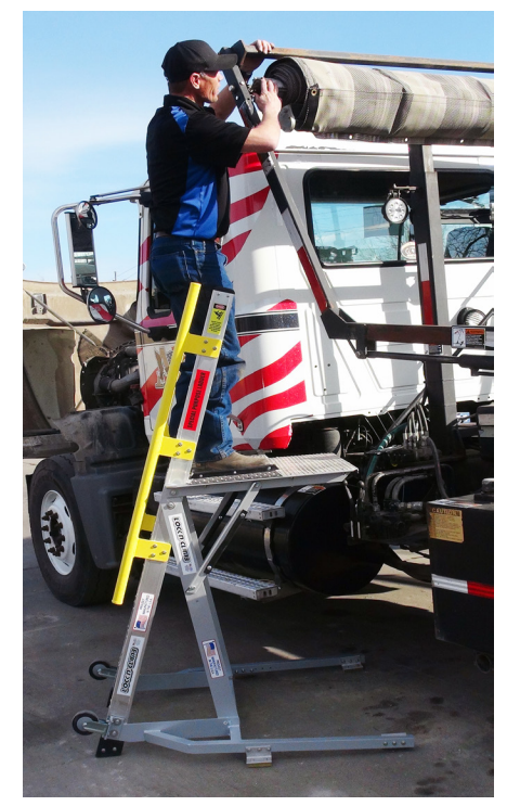
44LNCTRKENG: stable base slides around tire to service engine, running lights and other points around the entire truck.