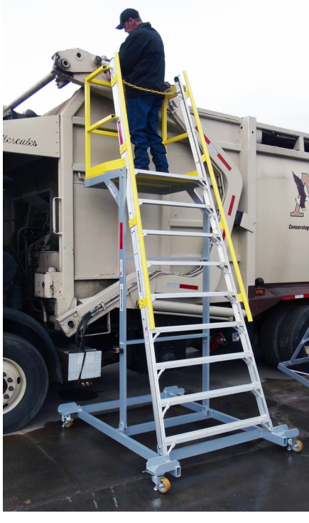
9LNCRFRTRKPLT: Locking base and secure elevated platform allows stable working surface for high maintenance service points.