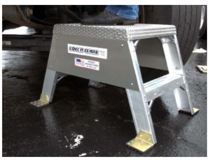
The 20LNCMINISTAND fits between the 44-inch tire and bumper and allows the maintenance technicians a stable slip-resistant platform to work on the truck engine rather than standing on slippery tires or struts. The 15LNCMINISTAND is employed when working on utility truck engines with 42-inch tires.