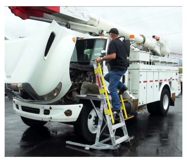
44LNCTRKENG stable base slides around the tire. Yellow handrails facilitate climbing using OSHA-recommended 3 points of contact to the wide slip-resistant platform to service engine, wipers, wind-shield, running lights and other points around the entire truck.