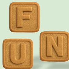
A-Z CRACKERS Nic&Co. # 00025288