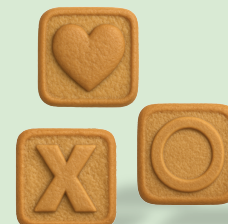
HEART CRACKERS Nic&Co. # 00025290

ALL SHAPES = 1oz GRAINS FOR NSLP - FUN AND DELICIOUS CINNAMON RECIPE KIDS LOVE!