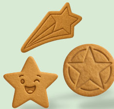
ALL-STAR CRACKERS Nic&Co. # 00025287