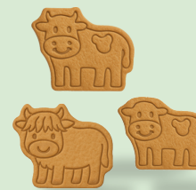
MOOKIE CRACKERS Nic&Co. # TBD