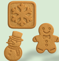
WINTER CRACKERS Nic&Co. # 00025286