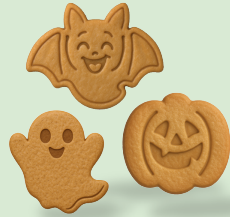
HALLOWEEN CRACKERS Nic&Co. # 00025285