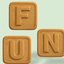
A-Z CRACKERS # 57071