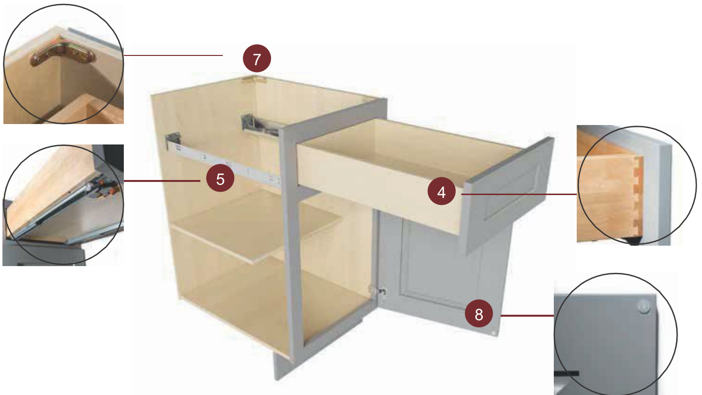
Base Cabinet with one drawer and one door in Castle Grey (S5).