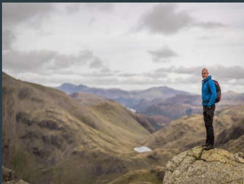
Scafell Pike (1hr)