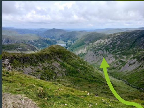
Lake District Windermere (30 min)