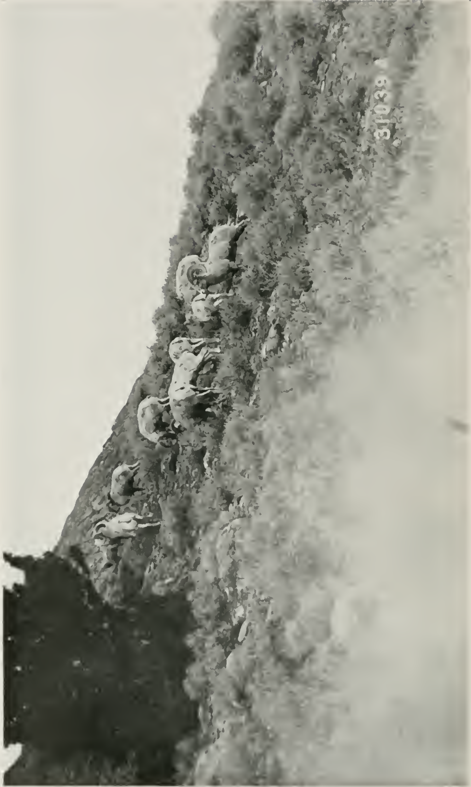
Big Horn Mountain Sheep