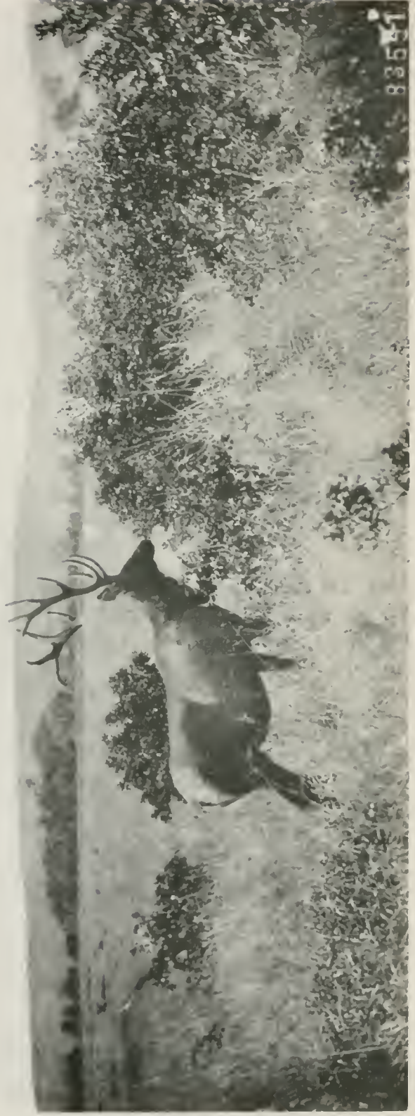
Six Point Bull Elk