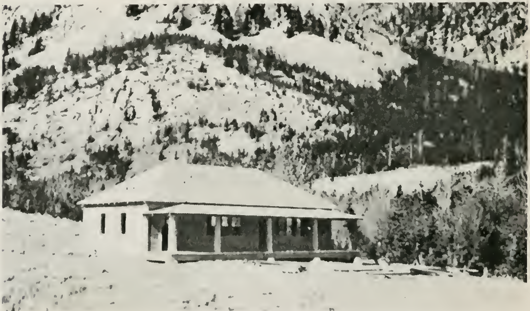
Fish Hatchery at Red Lodge—One of the Smaller Stations

There can be no question but that the Buck Law has increased our deer. The season of 1924 has brought reports of increase in deer all over the State. The elk are more than holding their own and excellent hunting for this animal is found in many parts of the State. The creation of the Spotted Bear Game Preserve on the west side of the Continental Divide, opposite the Sun River Game Preserve on the east side, has been the means of bringing about a considerable drift of elk from the Sun River side, where there was an over supply of elk for the amount of forage existing, to the South Fork of the Flathead where the Spotted Bear Preserve pro-