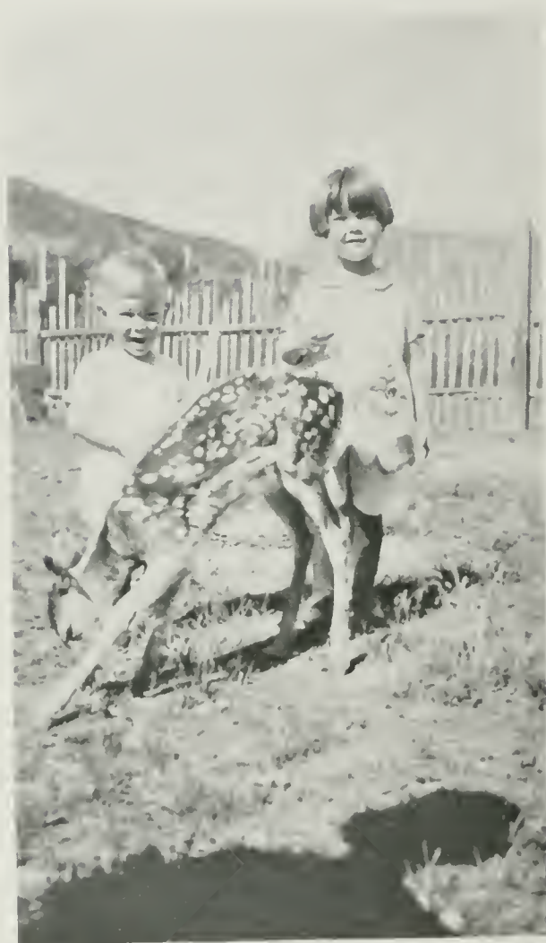
One of the "Kids"