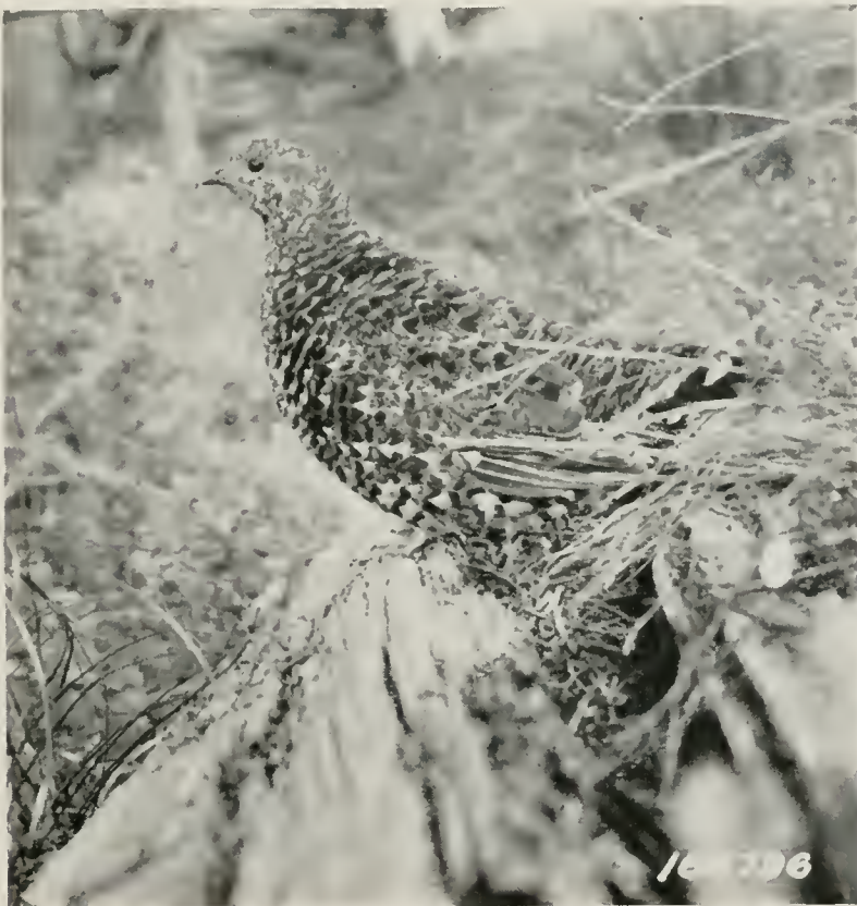
Franklin Grouse or "Fool Hen"

One of the reasons why I feel so hopeful, is the expression of interest, the desire to co-operate so manifest on the part of the sportsmen, themselves. Everywhere sportsmen are organizing clubs, many