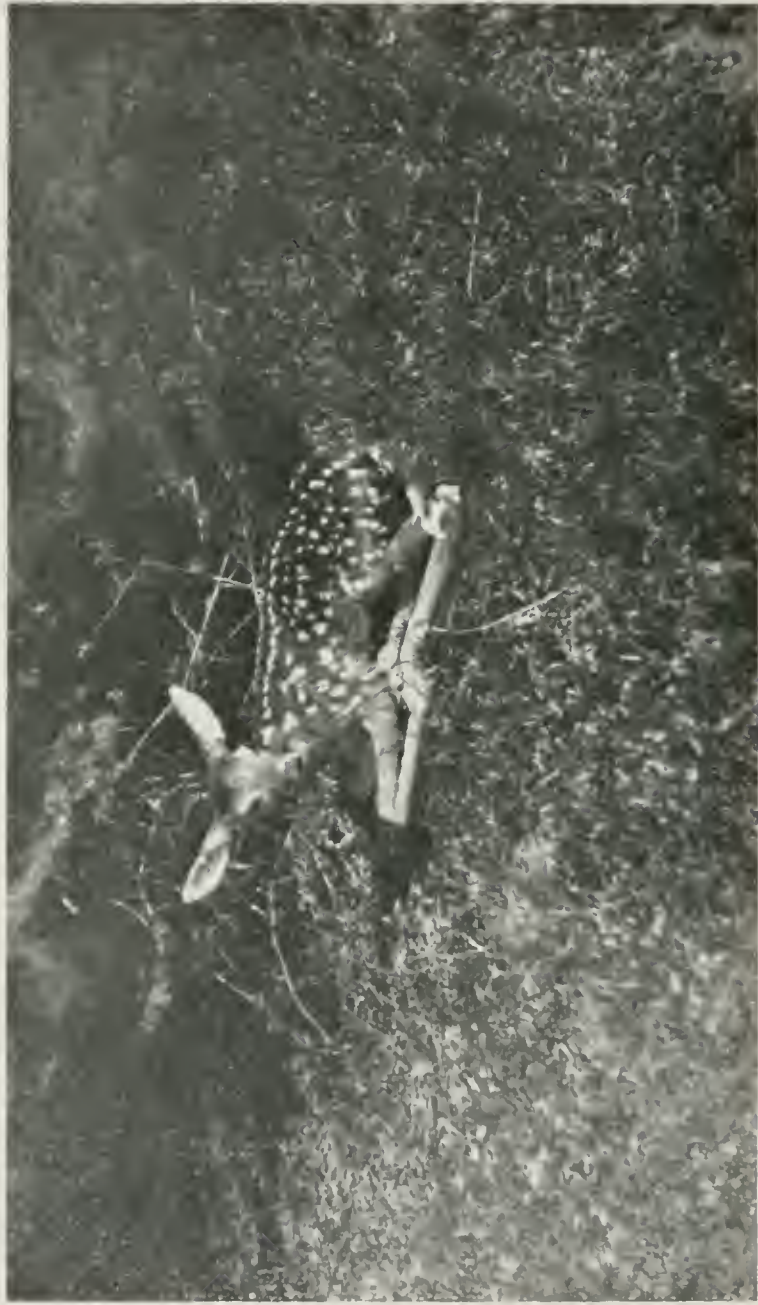
Spotted Fawn—Just Legs and Ears