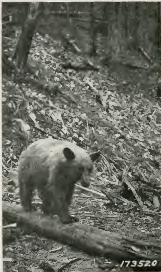
The Clown of the Hills