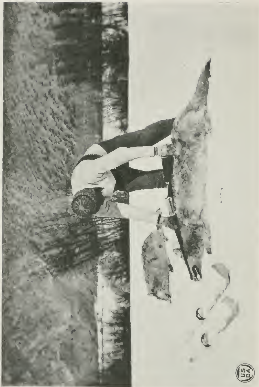
Two Gray Wolves