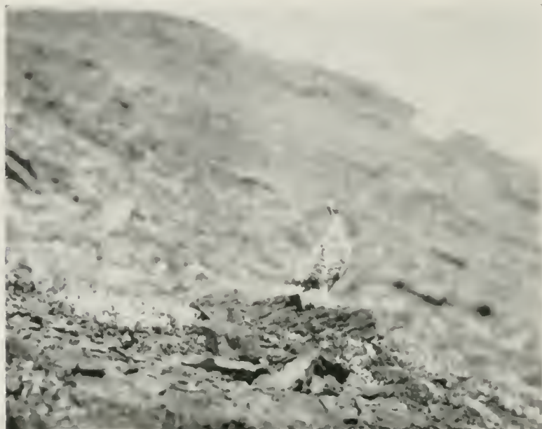
Richardson or "Blue" Grouse