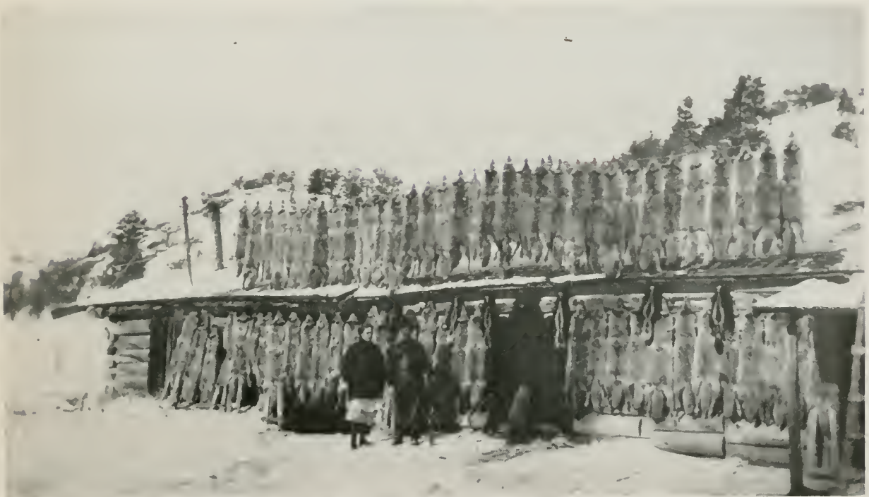
Cabin of State Trapper E. B. Warren in the Big Belt mountains near Lingshire, showing a portion of the pelts of his winter's catch of coyotes with a big bear skin in the center.