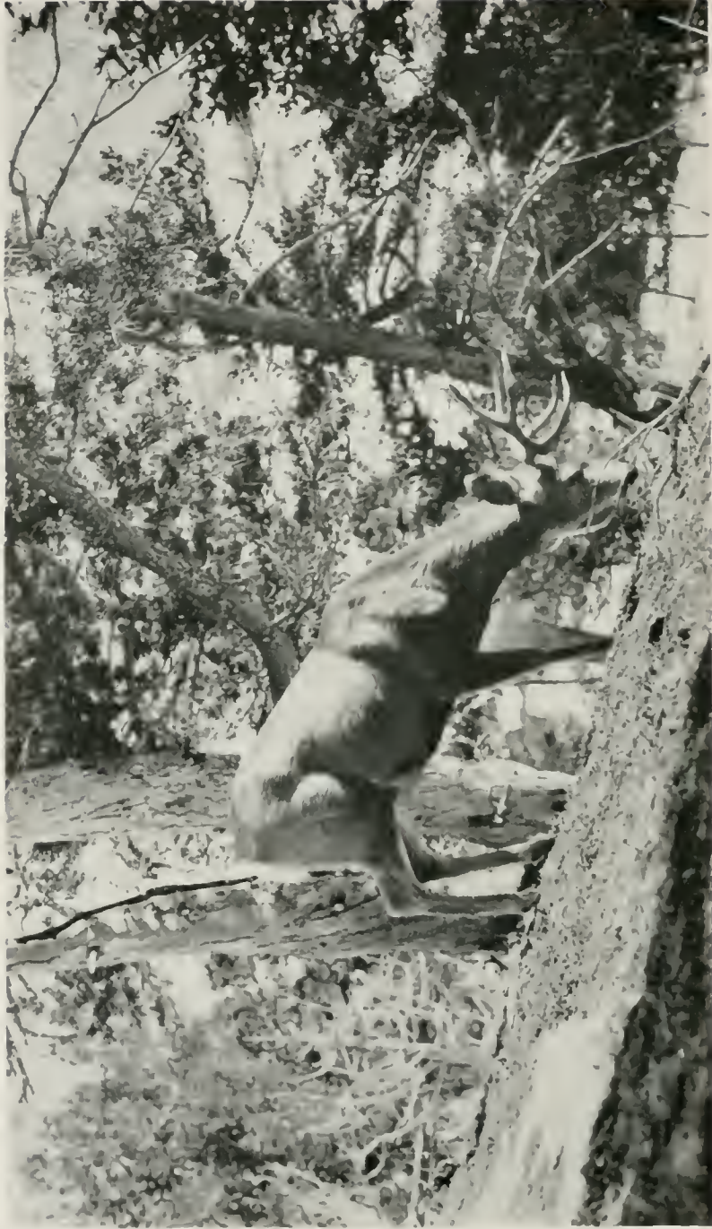
White Tailed Buck