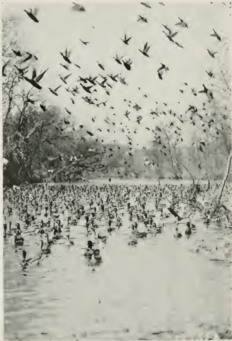
Just a Few Ducks