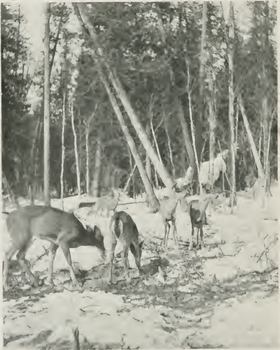
White Tailed Deer

in the National Forests? The writer does not believe it could and does not think that any considerable percentage of Montana citizens believe it could. The present grazing policy on the National Forests is not one incompatible with large increase in numbers of game animals, and it is believed that the present plan of making such adjustments as seem best after consultation with sportsmen, stockmen (a large percentage of whom are sportsmen also), state officials and other interested and informed citizens should continue. Its continuance means that much study must be given to the question and in that study the Forest Service seeks the assistance of all people who are informed on the subject.