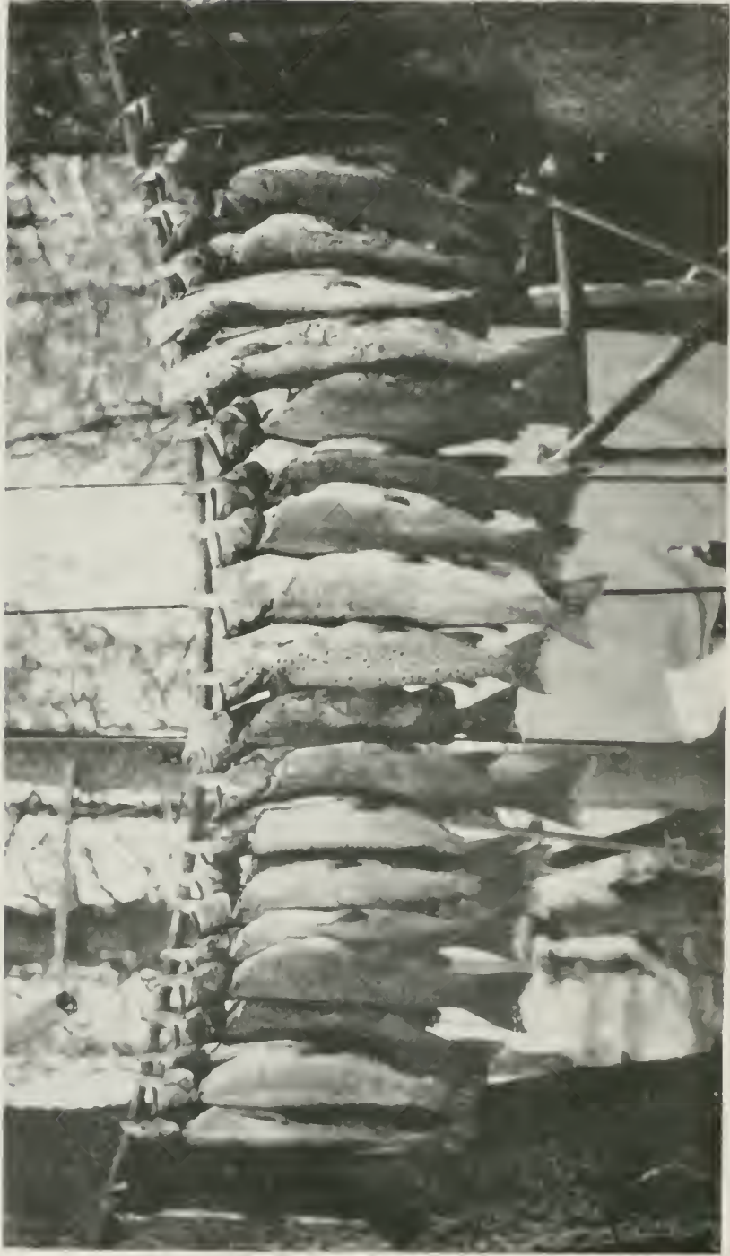
"The Limit"—Caught on the Madison