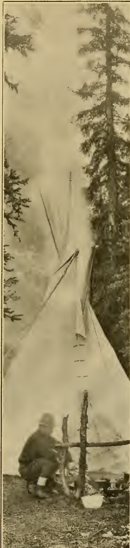
You furnish the tent. Montana will do the rest.

If one bathes with this solution before going into the woods, such plants as those cited above may be touched or handled without fear of poisoning. If the poisoning has already occurred, the parts should be bathed with this solution and dried thoroughly with a fan. Quicker results may be obtained by coating the poisoned parts with paraffin, on which should be laid a thin layer of cotton and a coat of paraffin put on top of the cotton. This excludes the air, prevents scratching and allows the new skin to be more quickly restored.