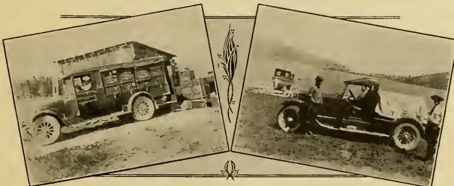
Two fish planting trucks of the fleet maintained by the State Commission illustrate the modern manner in which eggs and fingerlings are handled. The eggs from the spawn-taking station at Georgetown Lake, the largest in the world, are placed in iced cases, loaded in the truck shown at the left, and hurried to the hatcheries. The speedy truck at the right, stationed at Georgetown, is equipped with a special tank, modernized facilities for aerating the water and other devices for preserving fingerlings when taken from hatcheries to streams for planting and restocking. The second of these tank trucks has just been completed and is stationed at the Big Timber hatchery.

You'll never know the "feel" of wealth behind you, They'll never know you in the Hall of Fame, You will contribute to a cause that's mighty— You'll be a damned good Warden just the same.