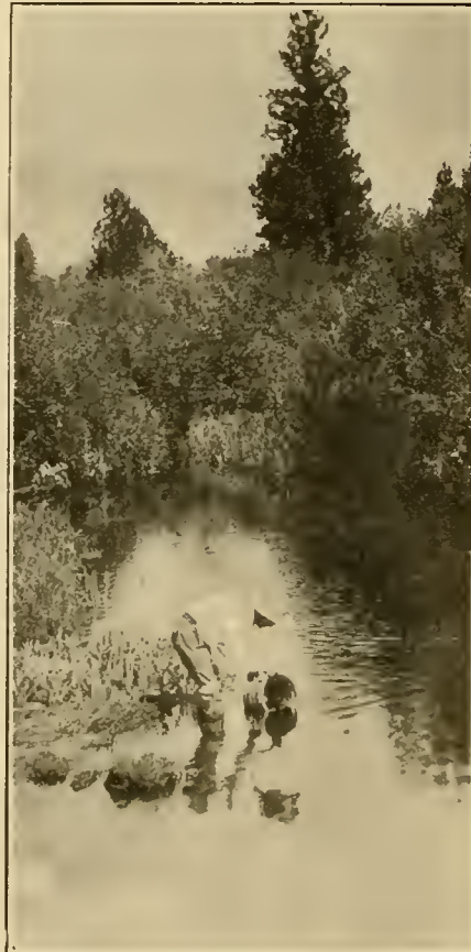
Planting fingerlings in the cool, placid headwaters of one of Montana's trout streams.