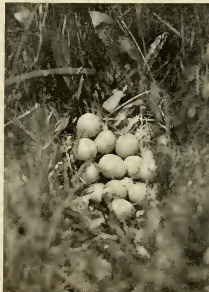
And here's the hidden nest with its 14 eggs that later produced 14 little striped Chinese chirpers.