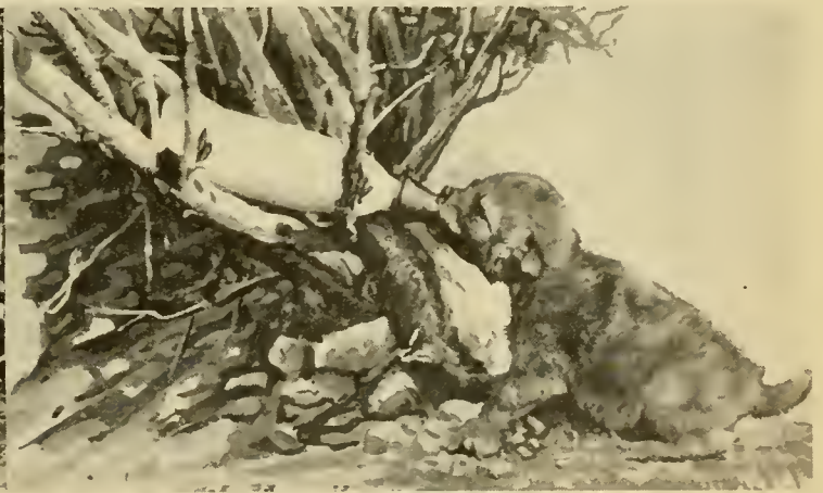
This husky coyote pup, whose home is at the Wixona Fur Farms at Denton, Mont., is strong for his bottle, but declines to take his milk from a human hand. He has no scruples in drinking when the bottle is lodged in a bush.

W HILE hunters employed by the State Fish and Game Commission, the Biological Survey and the Montana Livestock Commission, are riding the open country of Senor Yip-