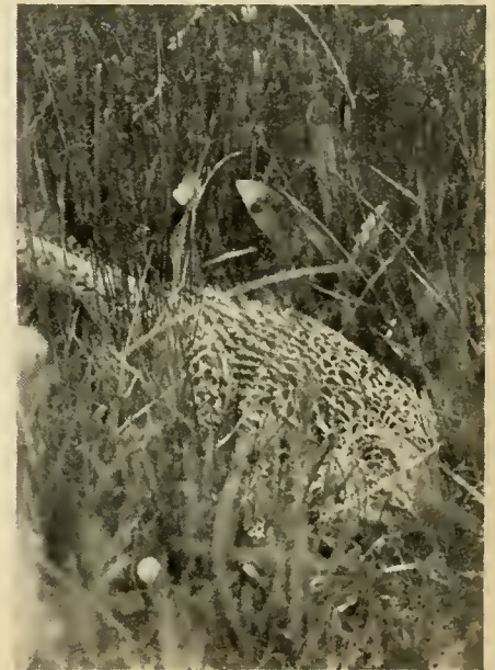
Here's another splendid view, taken in the early morning with Mother Pheasant still doing the incubator stuff.