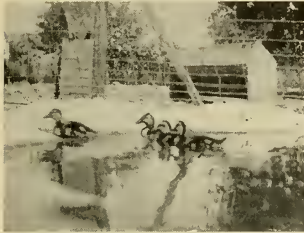
The little family, several weeks ago, able to care for themselves but with the down still covering their plump bodies. They are Billie's babies.

One day late in May, upon returning home Sunday evening, just at dusk, from a week-end camping trip, we went immediately to the chicken yard to see what had transpired during our ab-