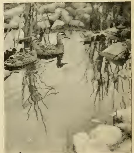
If you'll look closely behind Billie and Bobbie, you'll see the little black balls of down that are their children. All huddled up.

After laying 16 eggs, Billie was seen no more in the yard. Bobbie was al-