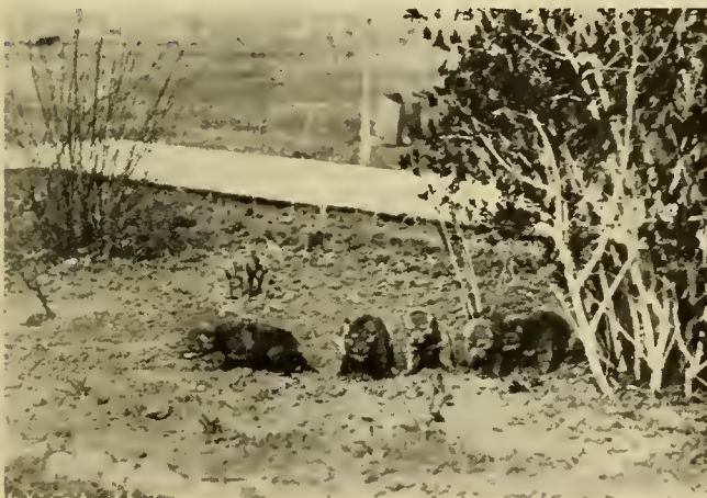
Coyote pups just old enough to be nosey, starting to grow into pretty red or silver fox furs for members of the aristocracy. They are members of the Yip-Yap family now but in a short time you'll never recognize them.