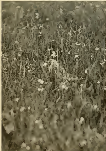
Here's Mrs. Chinaman in the tall grass keeping close watch of her nest while the photographer ventures near.