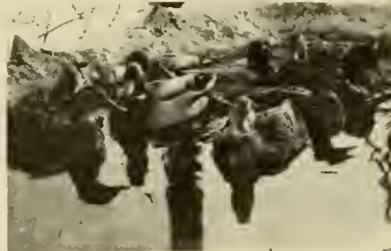
Here's the happy Mallard family in the Halm back yard. Note the reflections in the cool water.

Almost daily they would follow the trickle of water that drained from the