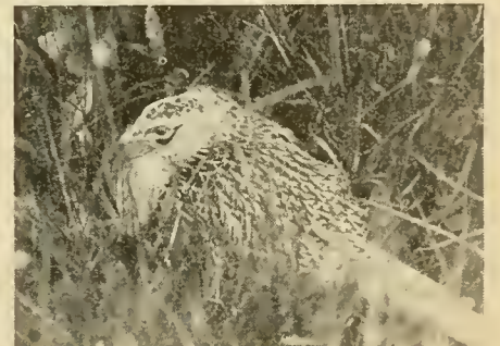
Drooping spirits marked the disposition of the Chinese pheasant hen on another trip to her nest. She is sitting tight, however, determined to protect the anticipated covey.