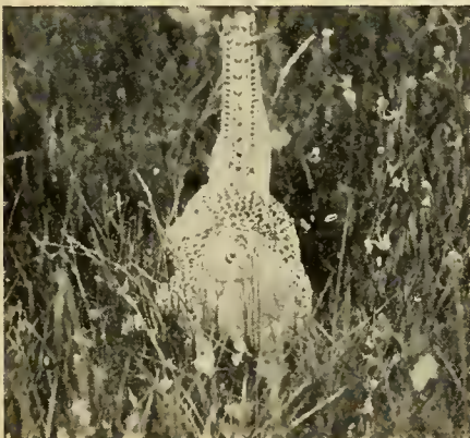
She's all fussed up over the effrontery of a snooping picture man who had the crust to point a black box at her.