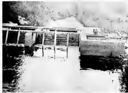
Reverse view of the fish screen wheels on the Madison river ditch, showing the screened wheels and protection against floating debris. The wheel is arranged in such manner that chips and branches pass over without damage.

Similar work is being conducted in the state by the United States Bureau of Fisheries. Plans of the federal department call for installation of wheels on the Jocko project and in the Sun river area near Great Falls, the pre-