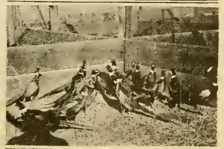
Pen of Mongolian Pheasant Cocks