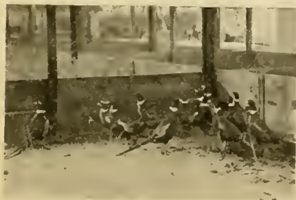
Chinese Pheasants at the State Game Farm