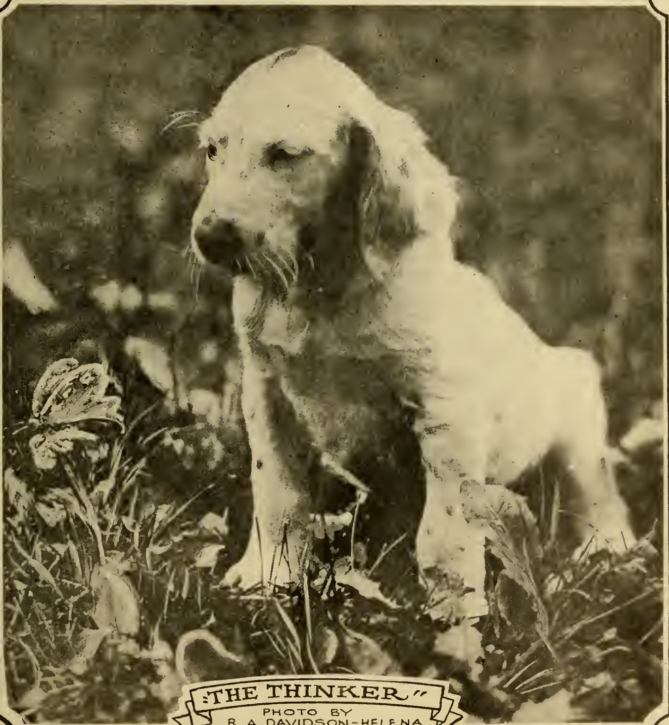
"THE THINKER"

Official Publication Montana State Fish & Game Dept.