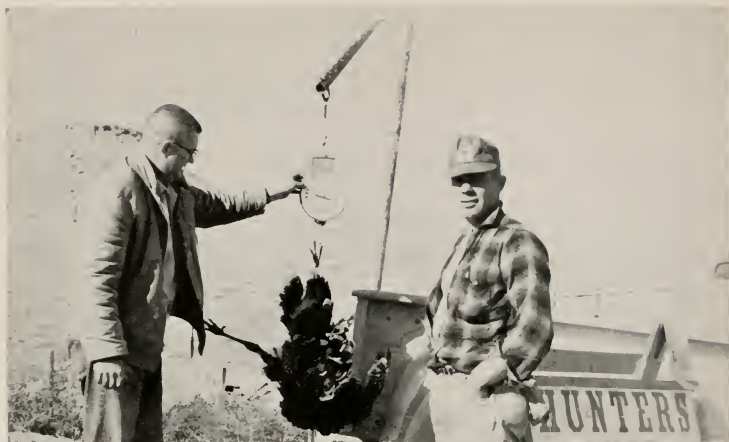
Checking stations provide harvest information as well as important biological information.