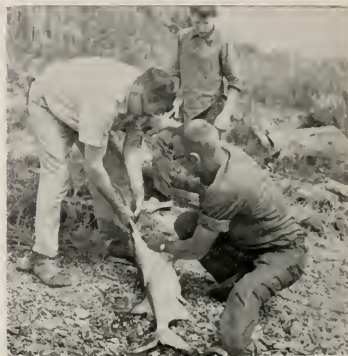
Paddlefishing near intake on the Yellowstone River.

Studies are underway on the reproductive rates of paddlefish in Montana, the age of sexual maturity, and other phases of their life history. This information will be used in developing a management program to insure perpetuation of the paddlefish and, in turn, paddlefishing.