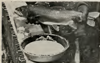
Taking fish spawn.

The Montana Fish and Game Department operates nine fish hatcheries located at Anaconda, Arlee, Big Timber, Bluewater (Bridger), Emigrant, Great Falls, Lewistown, Libby and Somers. The potential production of any hatchery is controlled by water quality, temperature and volume. These are most favorable at Lewistown, Anaconda, Bluewater and Great Falls. Thus these are the best stations and together with Arlee produce over 90% of the catchable-sized fish used in management programs. Arlee is the brood station for rainbow trout. A high-quality brood stock of these fish has been developed at Arlee and this station now produces all the rainbow eggs the department requires. Prior to the development of this brood, eggs were provided by trapping wild stocks and by direct purchase from out-of-state sources. Not only do we now have better quality eggs, but the supply is more dependable and the cost of eggs has been reduced.