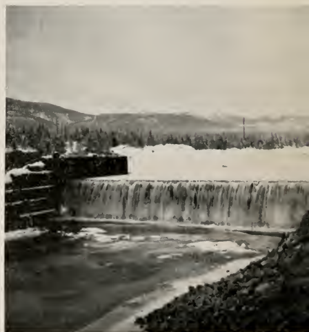
Clearwater River Fish Barrier—to prevent upstream movement of rough fish.

None of the reports by these agencies contain factual information on the fisheries resource or the probable effects the various developments will have on this resource.