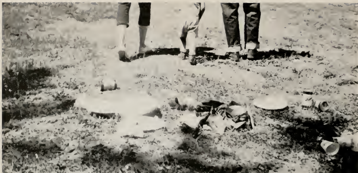
As use of recreational areas increases, problems of sanitation, safety, and protection of public property become more acute.

by highway construction, has been determined. No mutually agreeable solution to the remaining project has been reached. The matter can be resolved quickly by arbitration if the constructing agency notifies the Fish and Game Commission that it refuses to modify its plans as provided for under sections of the Stream Conservation Law.