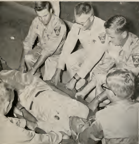
All Wardens are required to have training in current first aid techniques and to carry first aid cards.

In order to more effectively deal with the modern law violator, a new organizational plan has been instituted. The Montana Fish and Game Commission has authorized three new Enforcement Specialist positions whose duty it is to work on problem areas of enforcement. They may be moved any place in the state on short notice to deal with the more difficult enforcement problems. While the plan has only been in operation a short time, it is already showing very good results.