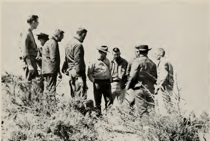
Information and education personnel assist in a number of field activities. This is part of a field trip group inspecting deer winter range.