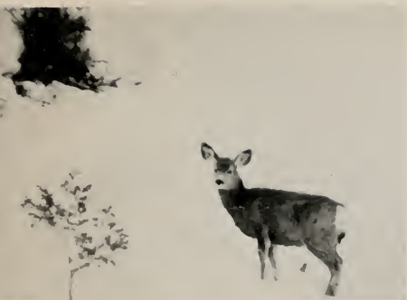
The objective of deer management is to adjust deer numbers to available forage on critical seasonal range.

deer forage has not been generally satisfactory to date. The largest, healthiest and most productive deer are found where food supplies are adequate and hunter harvest keeps deer in balance with available forage.