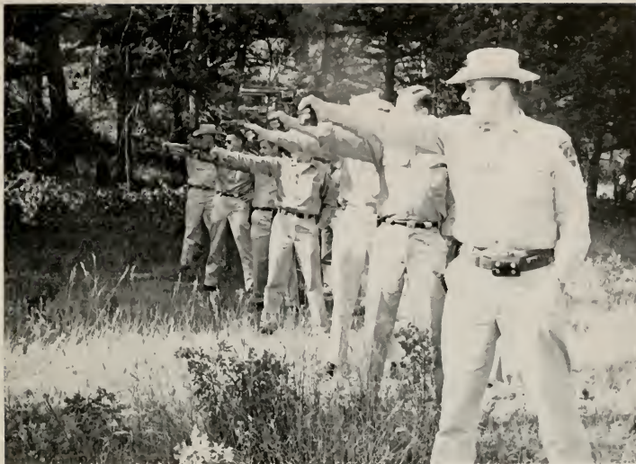
Warden trainees receive firearms training from F.B.I. instructors.