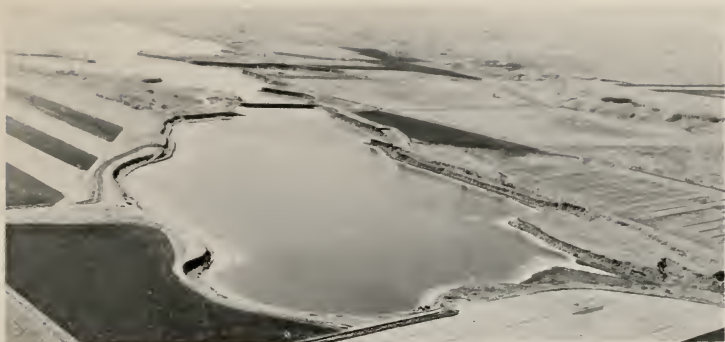
Fort Peck Dam Dredge cut.

used in Montana forest spraying against spruce budworm) and required 18 months to regain pre-treatment numbers.