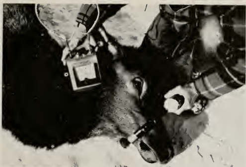
A radio transmitter collar is being placed on this elk for research purposes. The device with an antenna is for tuning and a final check on the transmitter.