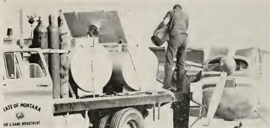
Use of aircraft and other modern methods has simplified and improved planting of fish.

The Montana hatchery system is alert to the many problems it faces. This alertness has made the production of quality fish a goal rather than the production of large numbers and pounds of fish alone. A quality fish may survive to end up in an angler's creel while a fish reared in an over-crowded or unsanitary condition will be nothing but a distribution figure from a hatchery.