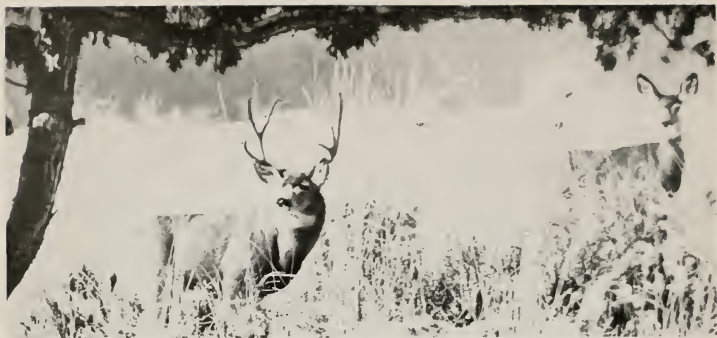
Game managers attempt to provide the maximum opportunity to hunt game birds and animals consistent with the welfare of the resource.