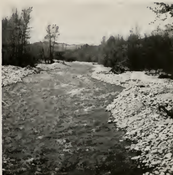
Physical requirements of fish are destroyed in manhandling of streams.

Two of the city-county projects were judged non-detrimental. The third was detrimental, but