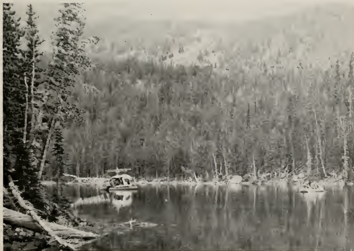
The use of a helicopter has greatly simplified survey work on high mountain lakes.

In 1962 the Montana Fish and Game Department purchased a helicopter for fish and game management work. Immediately mountain lake survey gear and methods were modified so this modern means of transportation could be used. A cost analysis of 45 lakes surveyed in 1962 disclosed the cost of transportation was $74.44 per lake. This was $5.00 less than our lowest cost per lake for rented horseback transportation. The survey took 13 days whereas by the old method 30 days would have been required.