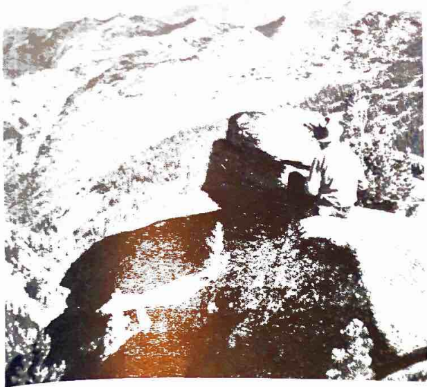
A member of the tour pauses to enjoy the grandeur of the Selkirk Range—looking north from the height of Squawman Lookout toward Lions Head Ridge. Mountain Goat inhabit these rough mountains.