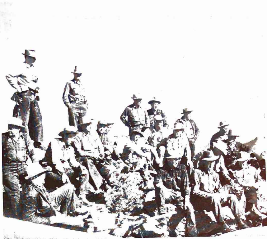
The party stops at Squawman Lookout to survey the Priest Lake drainage and to discuss resources of the area. Trip was made to acquaint State officials and private individuals with the region and to plan coordination of efforts for long term public benefits.