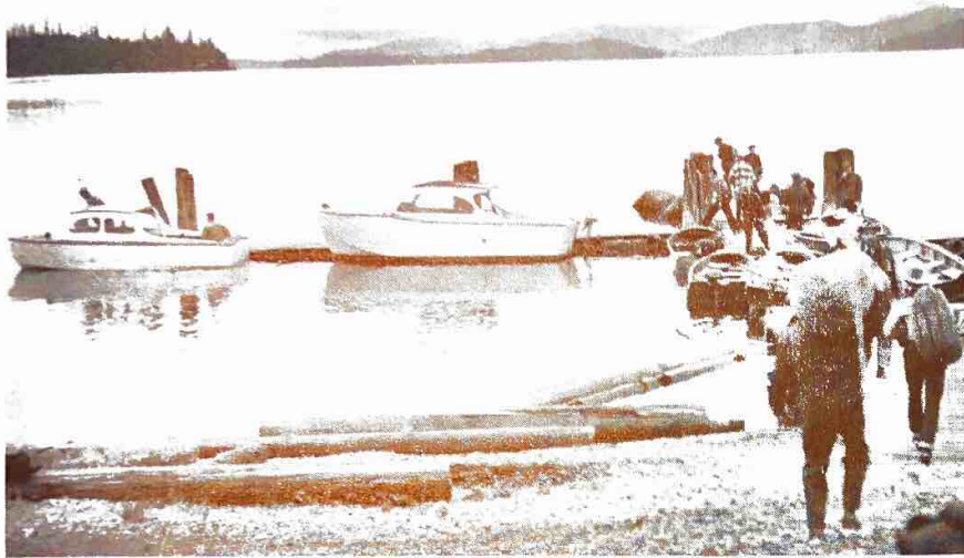
The second annual "Show Me" trip sponsored by the Priest Lake and Priest River Chambers of Commerce started from Grandview Resort where party members carry duffle to the boat landing ready for a trip across the lake.