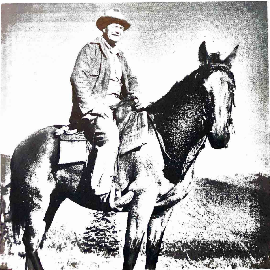
Governor Len Jordan stops near Hughes Ridge Lookout where the party gathered to view the Upper Priest Lake drainage. The Governor has participated in the trip both years.