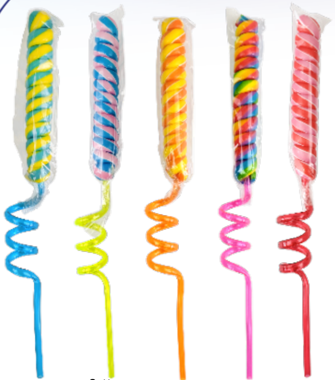
Blueberry Cotton Candy Orange Tropical Cherry