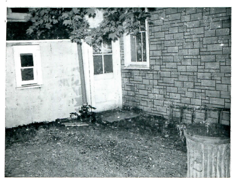
Rear Wall Rotting Away