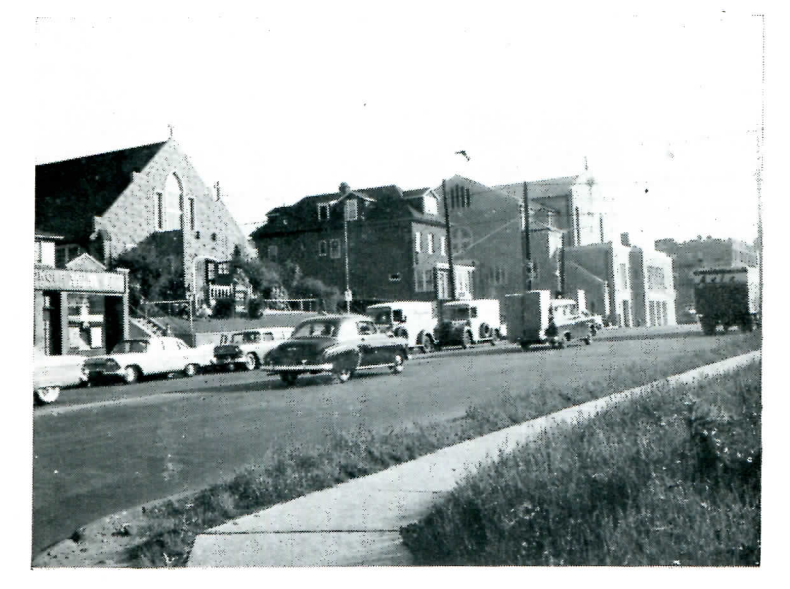
No Parking Space