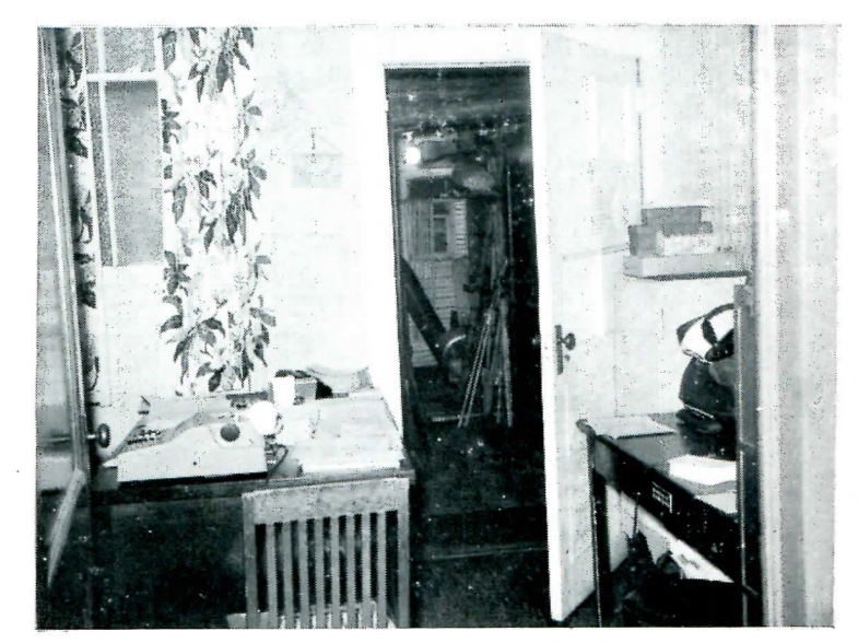
Organ Room - Dark and Dismal