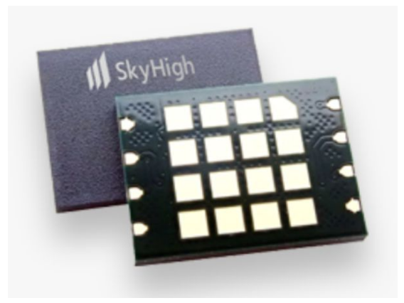
SkyHigh Memory 1-4GB SPI NAND

SkyHigh Memory Limited., a global leader in embedded storage solutions, is introducing 3.0V 1Gb-4Gb densities 4KB page and 2KB page ML-3 products to its family of NAND Flash memories. The new 1Gb-4Gb ML-3 SLC NAND Flash product family devices are designed on 1xnm, the industry's most advanced technology node for SLC NAND products.