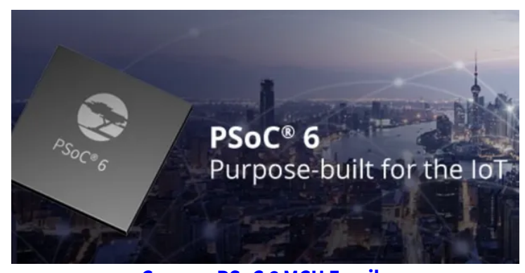
Cypress PSoC 6 MCU Family

In conjunction with Sony Semiconductor Israel (Sony, formerly Altair Semiconductor), STMicroelectronics, and Truphone, Murata today introduced the availability of the Type 1SE module, a highly integrated, miniaturized, low power cellular IoT solution featuring a low power STM32L4 MCU and an ALT1250 M1/NB modem. Measuring just 15.4 × 18.0 × 2.5 mm, it combines four key components that enable fast and low-cost product development: STMicroelectronics' ultra-low power STM32L462RE/Arm® Cortex®-M4 core with 512 KB Flash and 160KB SRAM MCU, Sony's Altair ALT1250 solution-based low-power LTE Cat M1/NB1 modem and integrated SIM. Further, it is preloaded with Truphone's SIM profile, allowing the module to operate worldwide – the first of its kind to do so.