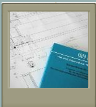
INNOVATION POWERED BY TECHNOLOGY ...