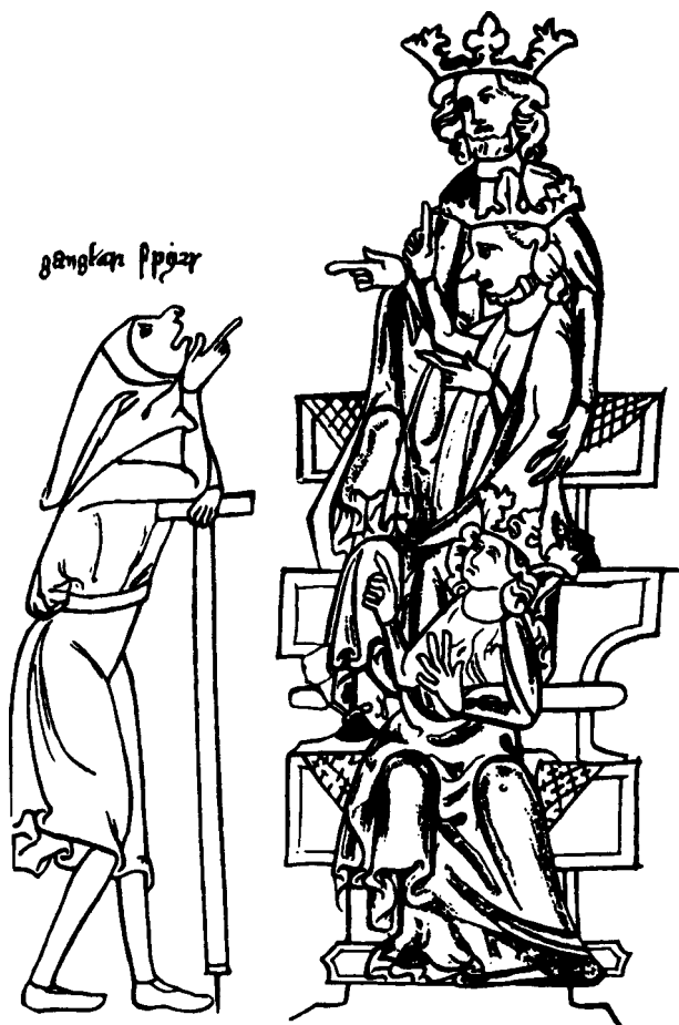
The drawing depicts Gylfi (Gangleri) questioning his three informants in Gylfaginning (Icelandic, ca. 1300). From the Uppsala manuscript of the Prose Edda , Uppsala University Library, DG 11, f. 26v.