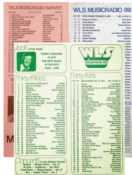
WLS Music Survey Vol 5, 1973-1975