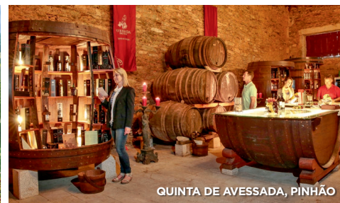
QUINTA DE AVESSADA, PINHÃO

BOOK BY MAY 31, 2021 AND SAVE $750 PER PERSON ON CRUISE FARE 7-NIGHT RIVER CRUISE ABOARD THE AMAVIDA from $4,099 $3,349 per person