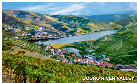
DOURO RIVER VALLEY