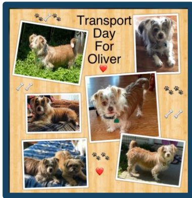
Sweet Oliver heads North