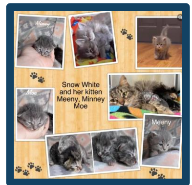
Mama Snow White with kittens Meeny, Miney & Moe.