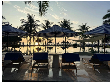
7 nights in Ubud in the