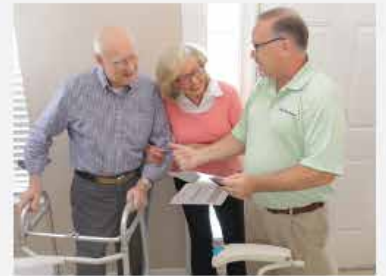
Lifetime Parts warranty