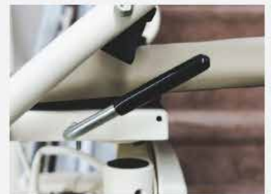
Swivel seat for a safe exit