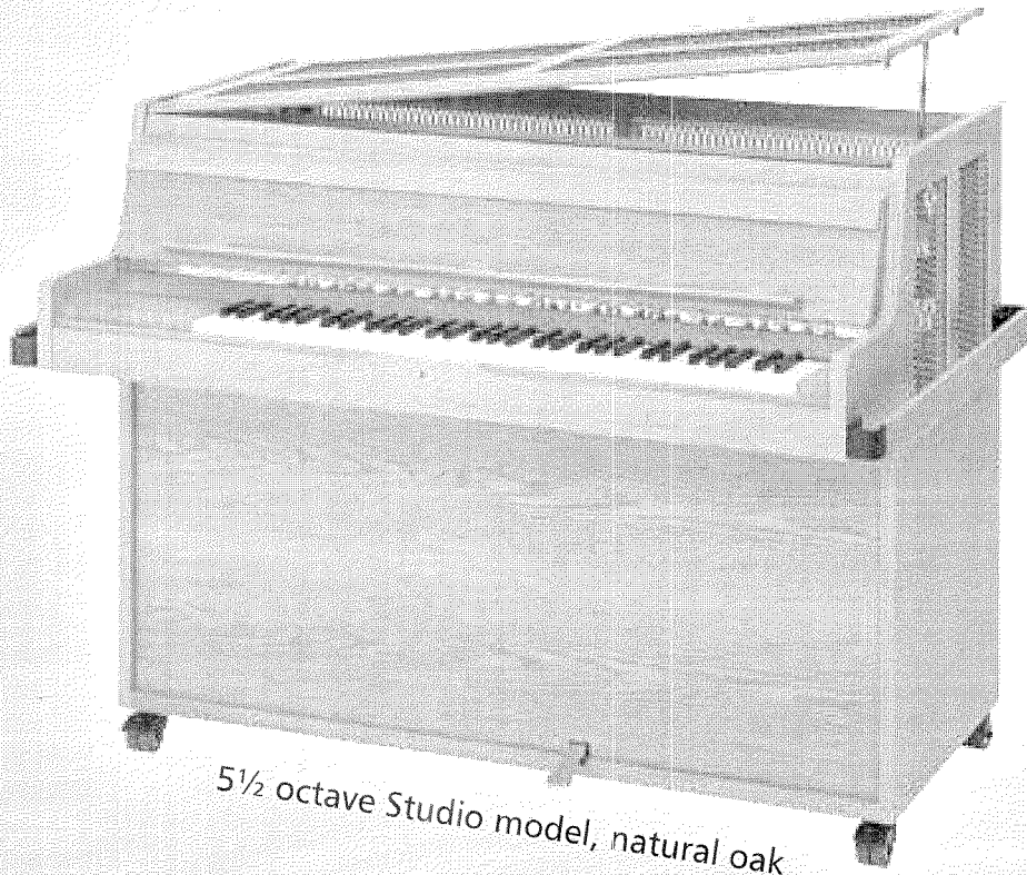
5½ octave Studio model, natural oak

The World's Only Manufacturer of the Celesta as invented and patented by Victor Mustel